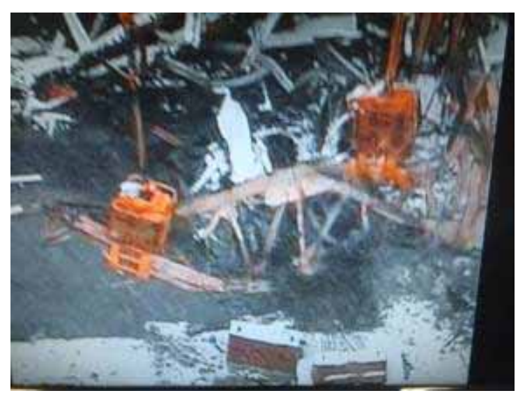
Steel truss debris (being lifted up)

The atmosphere doses in the upper part of the spent fuel pool before and after the debris removal work were 25.6mSv/h and 21.3mSv/h. No significant change was found with the spent fuel pool water level.