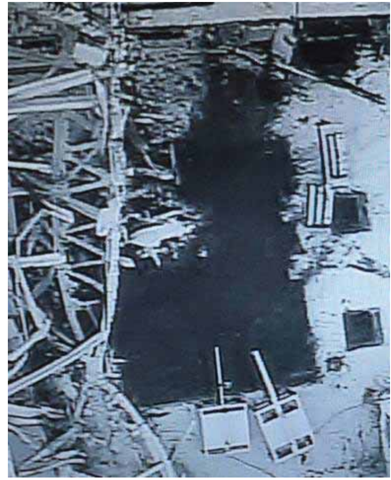
Spent fuel pool (after steel truss removal)

As a result of monitoring the debris utilizing an underwater camera and a camera, the debris was confirmed to have no impact on the fuel rack and the pool liner.