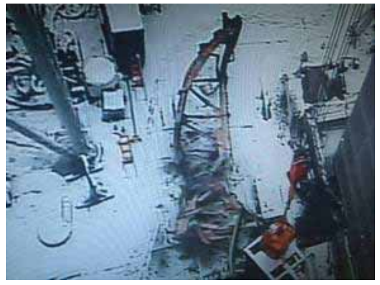
Steel truss debris (after removed)