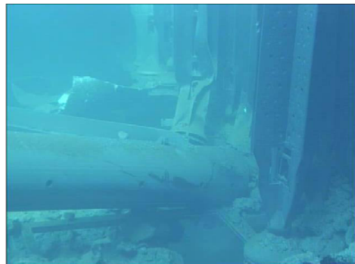
Condition of the fuel handling machine mast (Lower edge) (Photo taken on February 13, 2013)

The fuel handling machine mast* was found on the fuel rack and was not directly contacting the spent fuel storage rack and the liner.