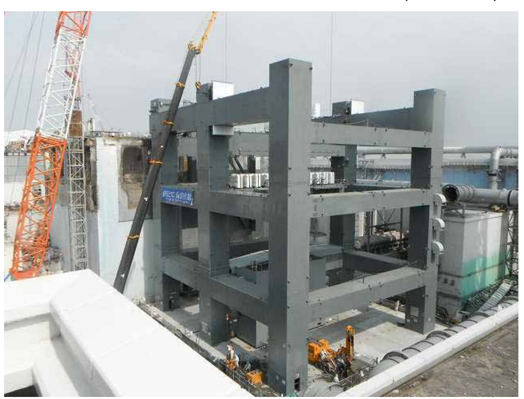
The third layer of steel frame completed

Materials used: 6 columns and 7 beams (Total: 13)