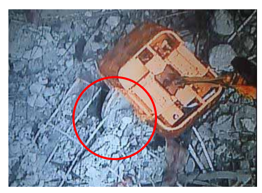
2. During work (April 18, 2013)