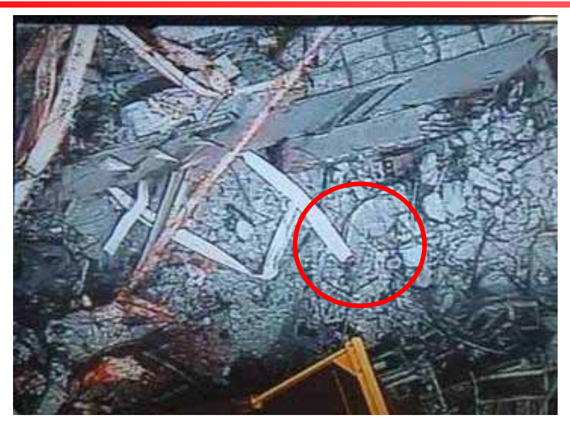
1. Before work (April 17, 2013)