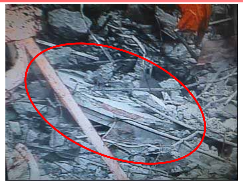
3. Hatch returned to its original position (April 18, 2013)