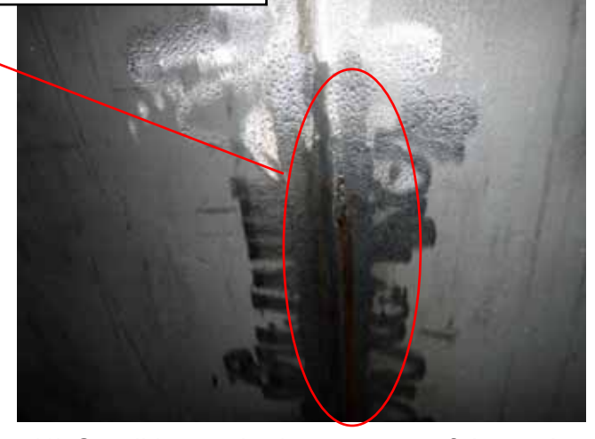
(1) Condition at the bottom part of the tank (enlarged image)