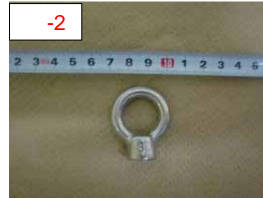
[Previously announced on May 29]