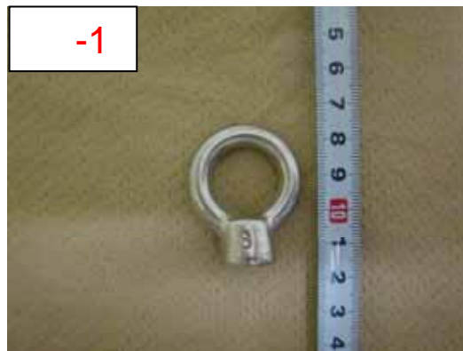
[Previously announced on May 29]