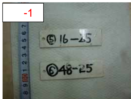
on July 10, 2013