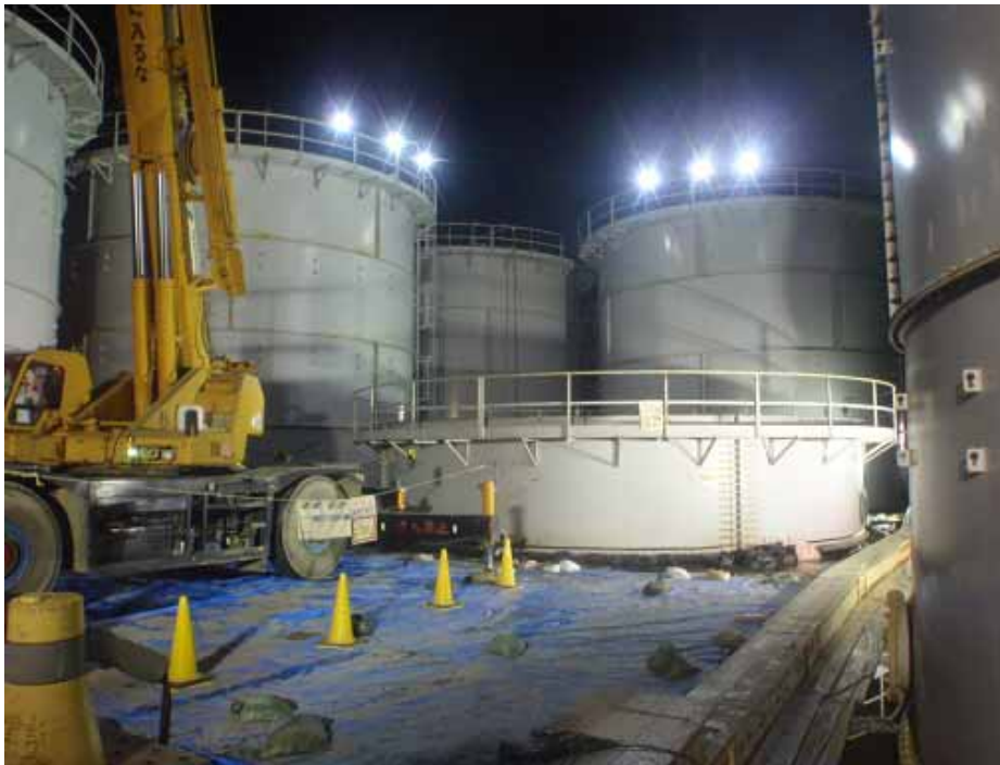
The tank No.5 in H4 area Completion of the side plates removal (2 nd layer) (Photo taken on September 18, 2013)