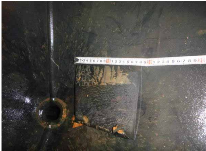
One of the rubber pads for ladder found detached (found near the drain hole)