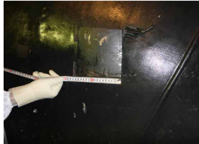
The other one of rubber pad for ladder found remaining attached at its original location (measured for size after being released from fixation with tape)