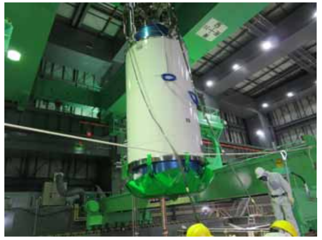
Lifting up the on-premise transportation container (2)