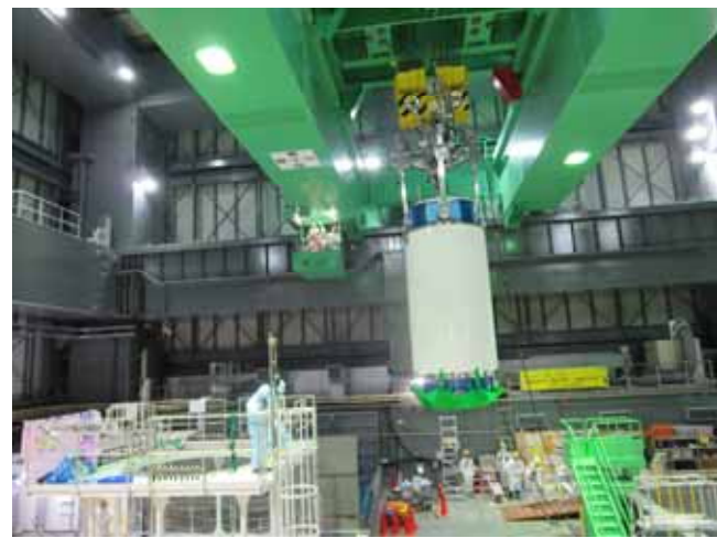
Lifting up the on-premise transportation container (1)