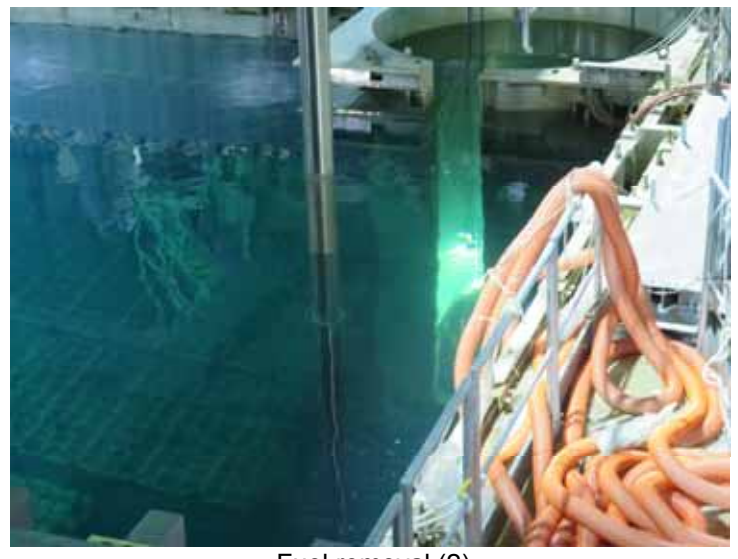
Fuel removal (2)

A pit containing the on-premise transportation container