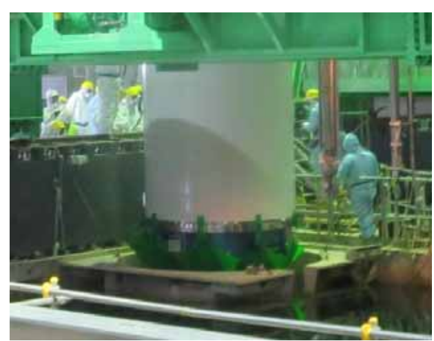
Bringing the container down to the pool water (1)