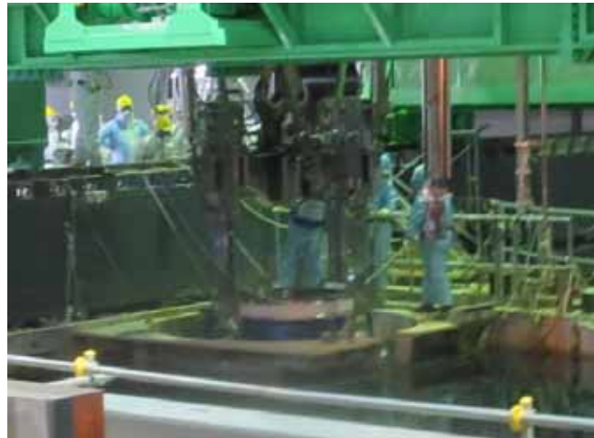
Bringing the container down to the pool water (3)

Photos taken on November 18, 2013