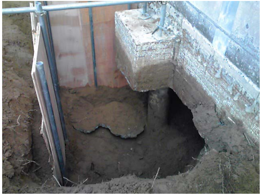
Accident site near the empty container warehouse (2)