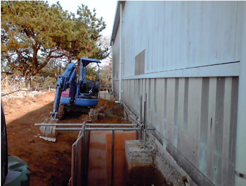
Accident site near the empty container warehouse (1)