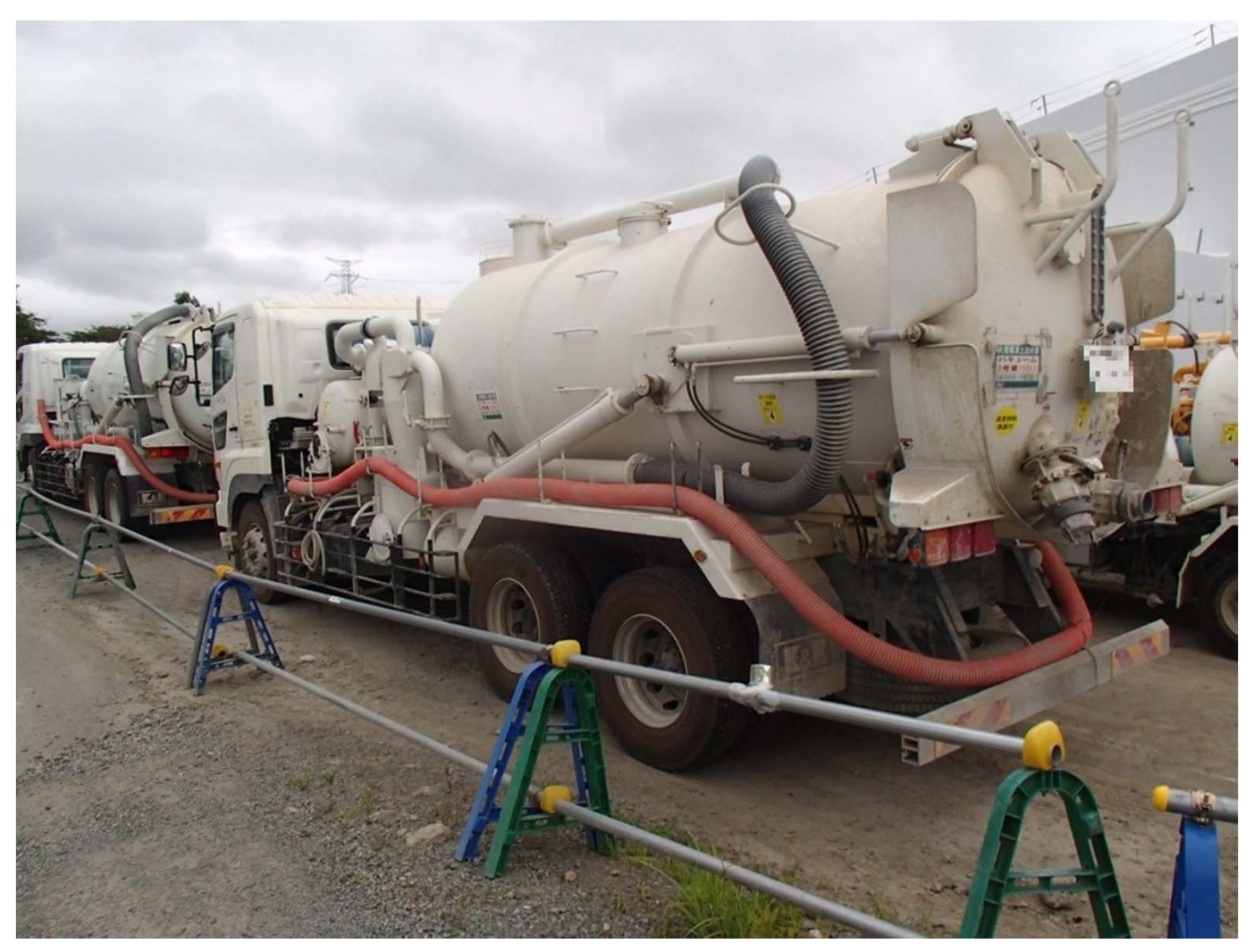
Construction vehicle of the same model