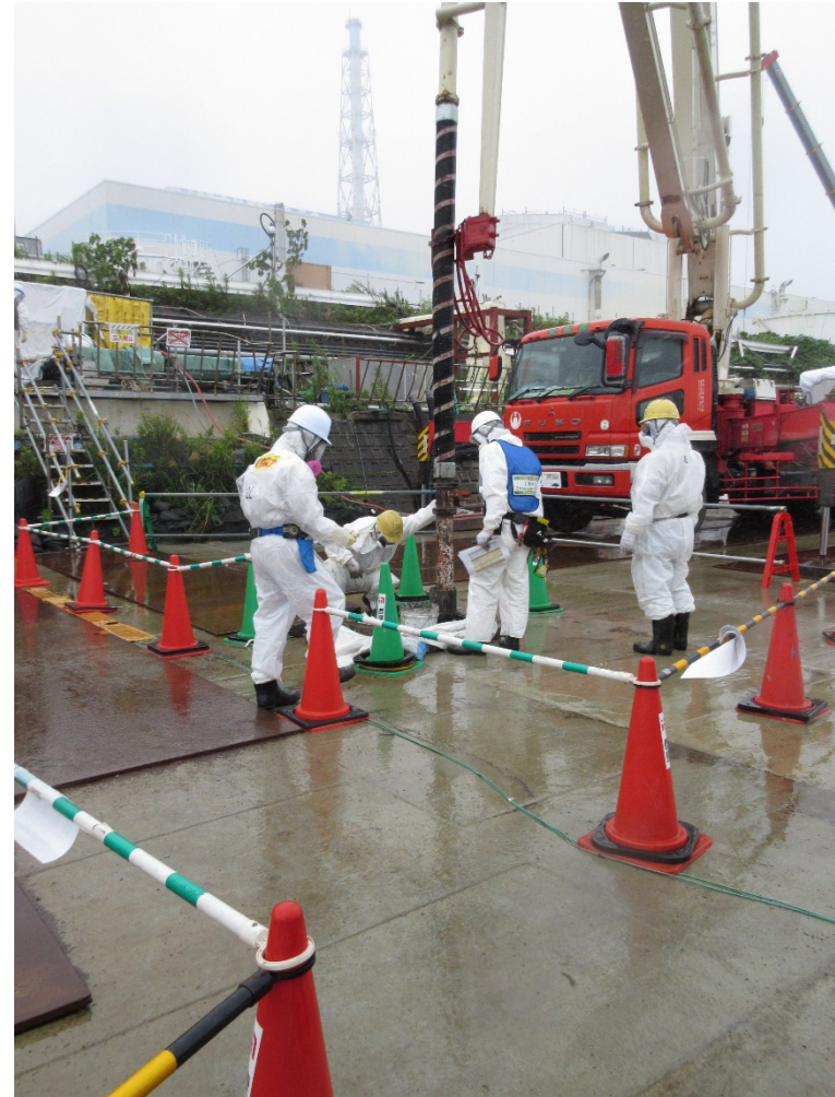
Photos taken on August 27, 2015