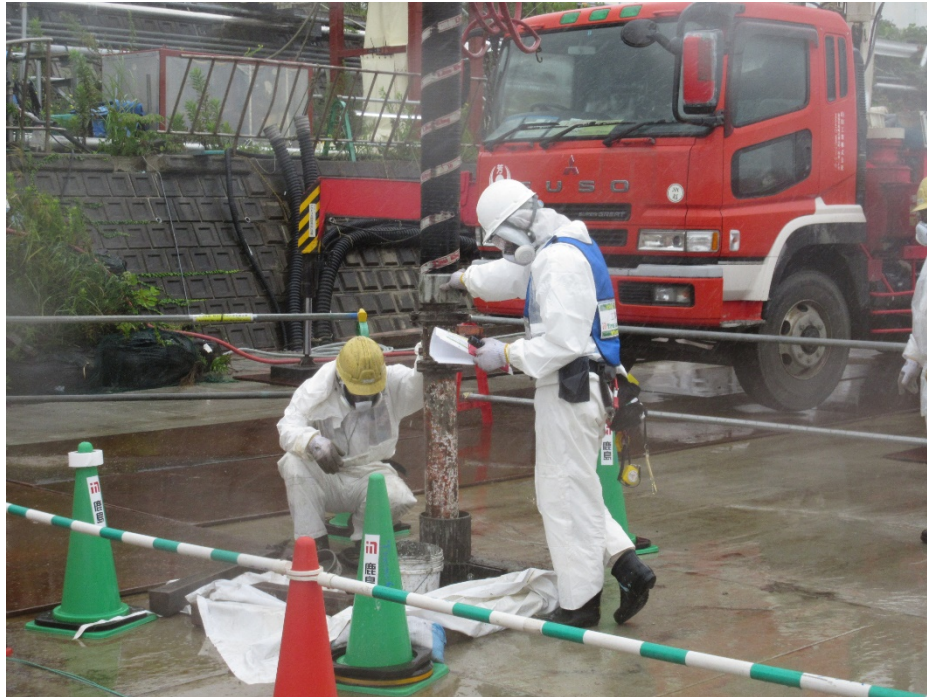
August 27 Filling up Shaft B