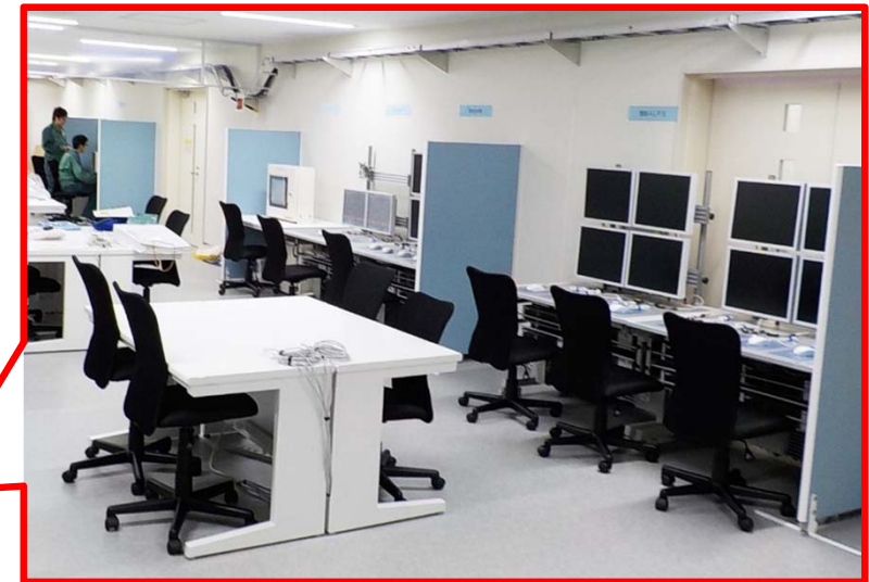
Expanded area to monitor and operate water treatment facilities