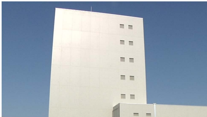
Large rest house (Outside)