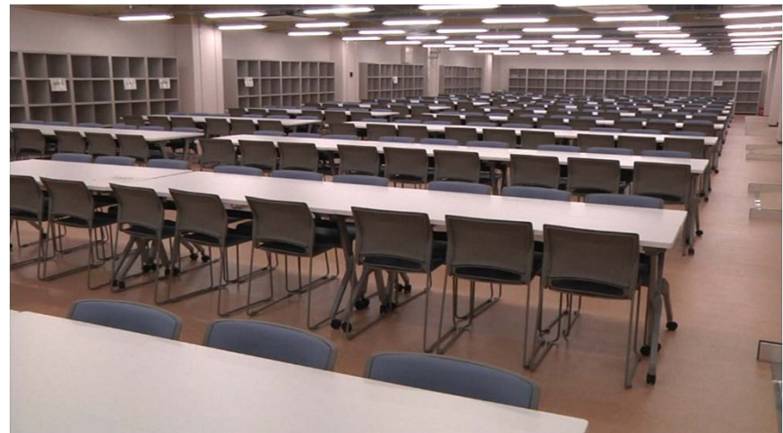
Large rest house (Inside)