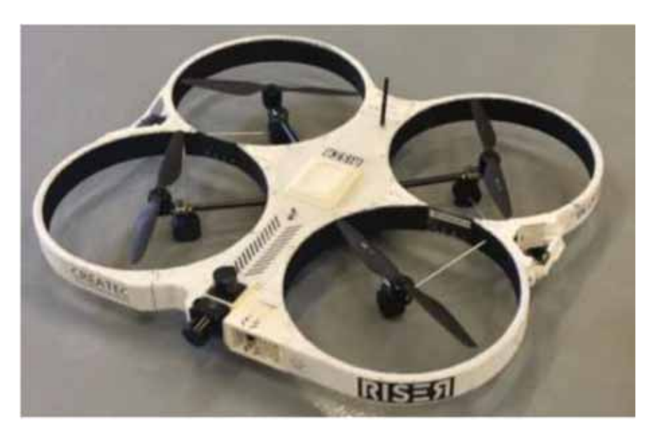
Main body of RISER