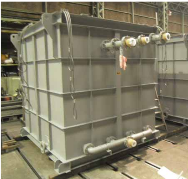
date: May 29, 2011 source: Toshiba