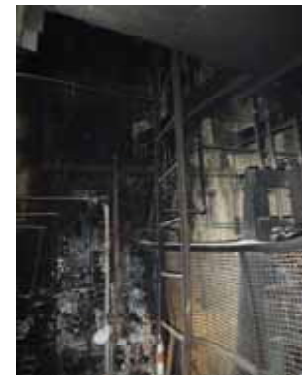
Nearby Instrumentation rack ( area )