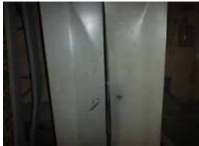
Exterior appearance of instrument panel ( area )

Date of survey : June 9, 2011 11 : 47 am ~ 0:14 pm Number of Workers : Total 9 ( TEPCO 5, Partner Company 4 ) Dose : 5.88 ~ 7.96mSv Area : South side and west side of first floor, reactor building of Unit 3