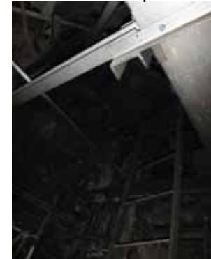
Upper section of Nearby Instrumentation rack ( area )