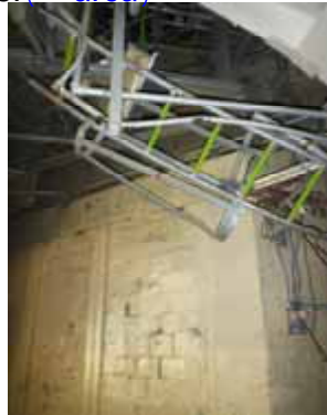
Ladder ( area )