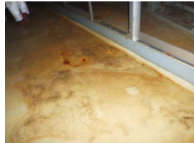
The floor in front of the reactor instrumental rack