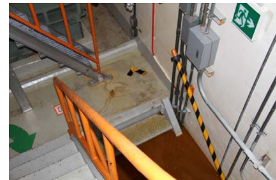
Stairs at Southeast side (intermediate floor between the 1st floor and the 1st basement)