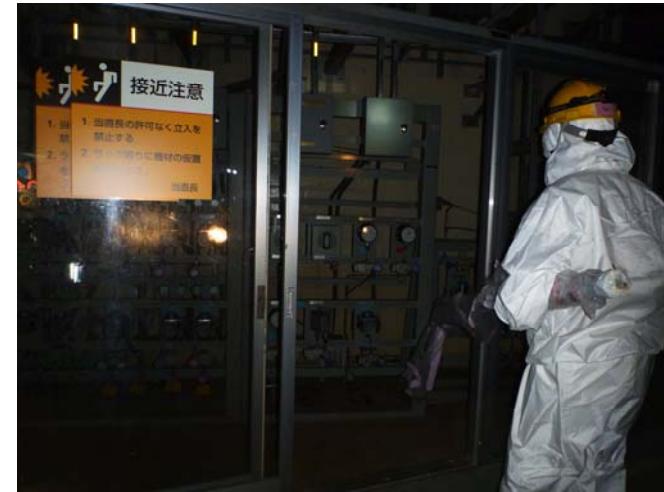
Reactor instrumental rack