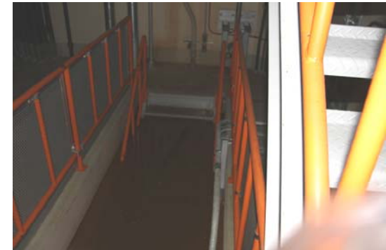
Stairs at Northeast side (intermediate floor between the 1st floor and the 1st basement)

【Entry result】 1:15 pm to 1:25 pm, June 21 • 7 employees and 3 cooperative firm employees • Planned : 6mSv • Result : 5.52mSv(Maximum), 2.16mSv(Minimum)