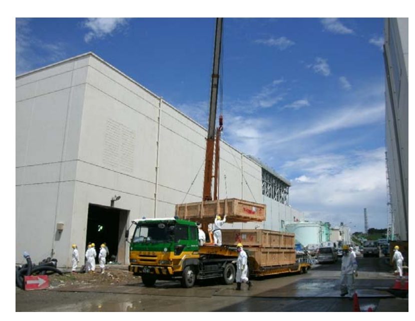
Carrying in parts