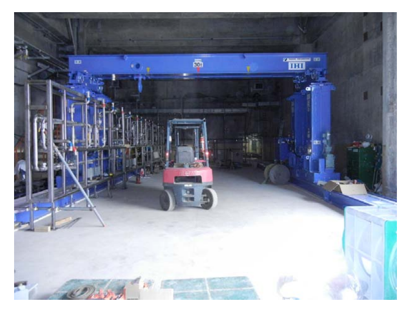
Installing a lifting equipment for changing containers