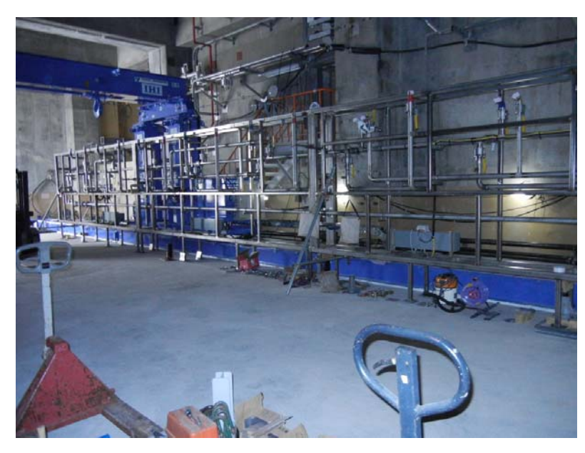
Installing valves and piping