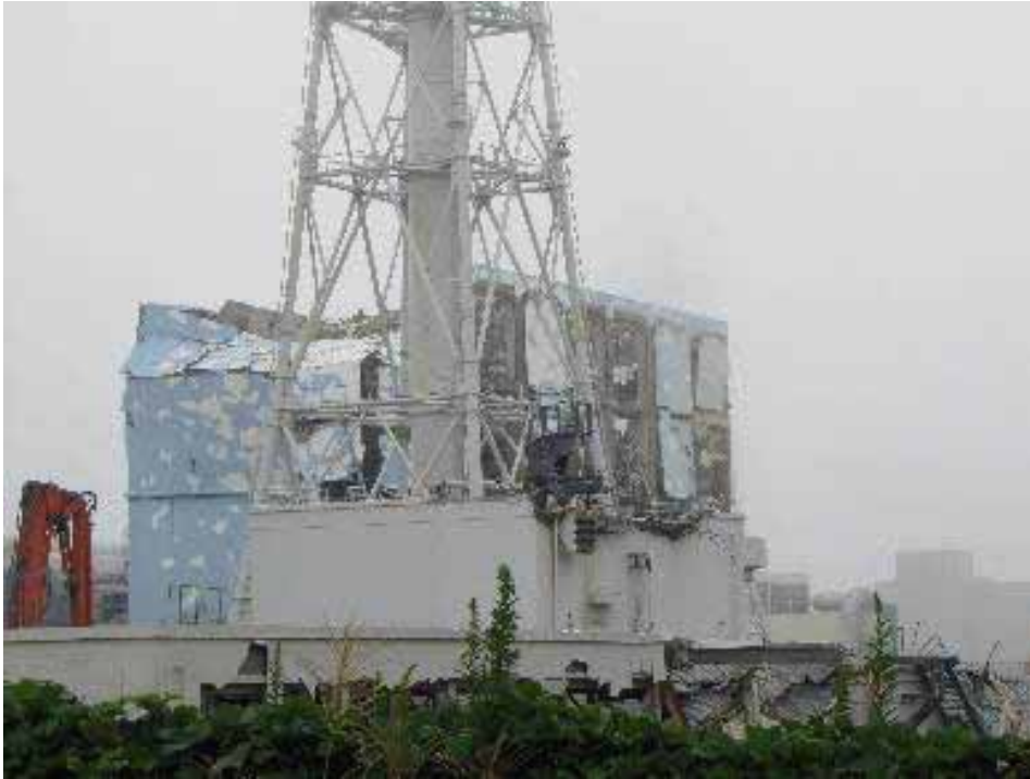
Overview of a reactor building from western hilltop Sep 15, 2011