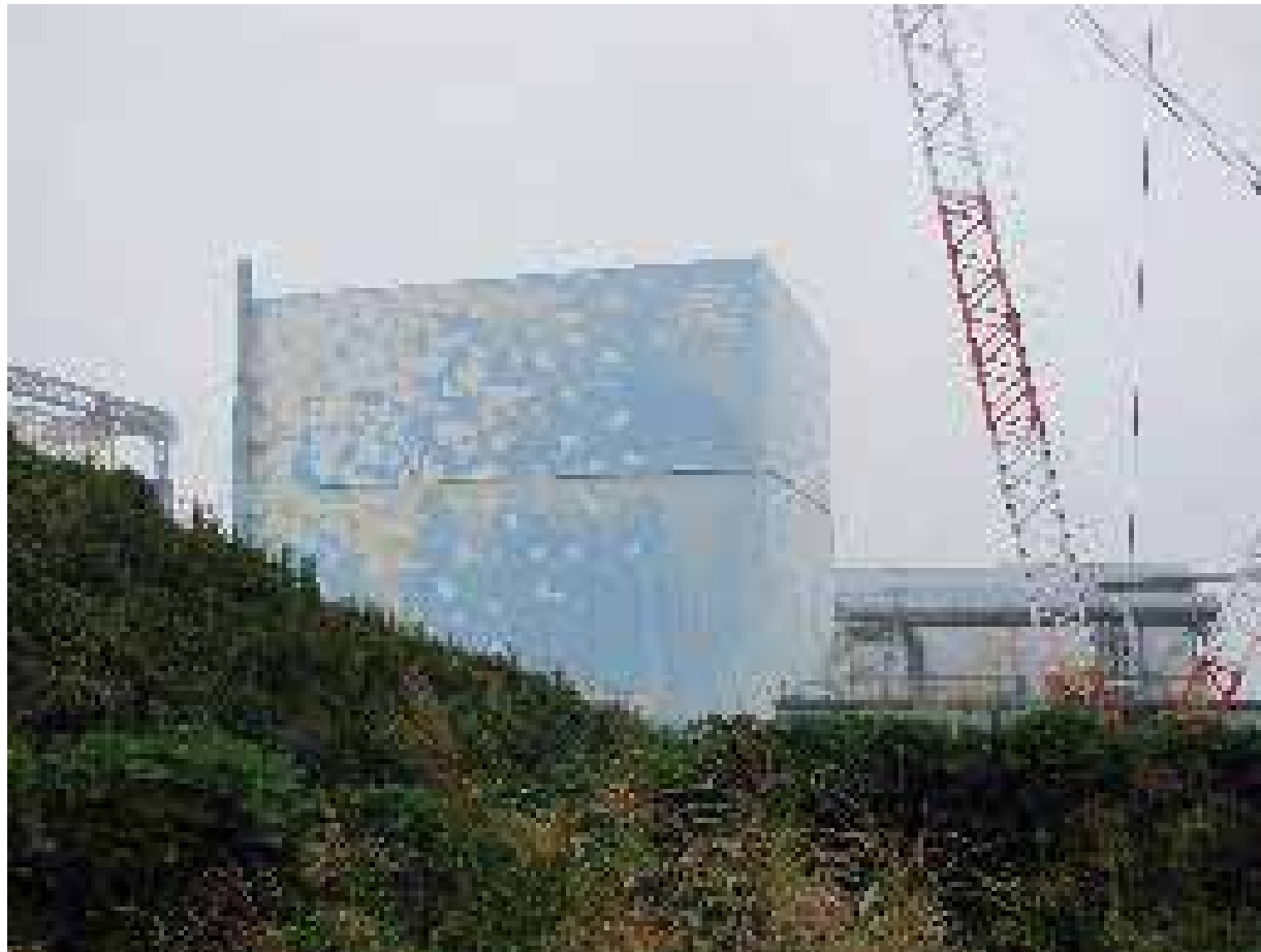
Overview of a reactor building from western hilltop Sep 15, 2011