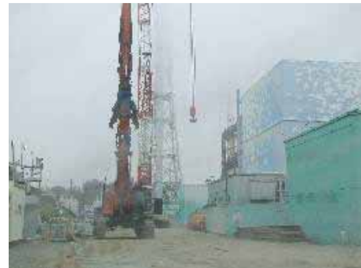
Rubble collection preparation of a reactor building ~ north direction (Unit 1&2) from Unit 3 ~ Sep 15, 2011