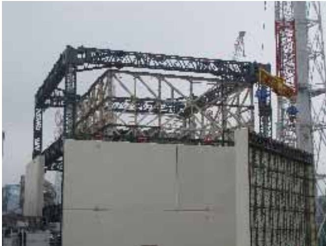
Reactor building cover from northern side Sep 15, 2011