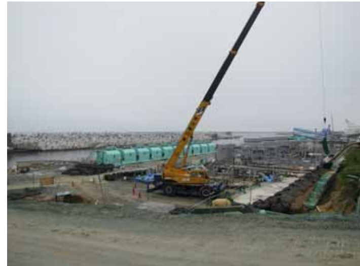
Maintenance work at port and harbors from Unit 6 seaside yard Sep 15, 2011