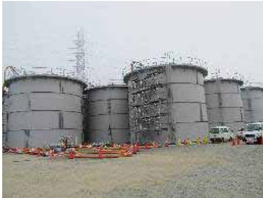
RO concentrated water storage tank (H1 east area) Sep 15, 2011