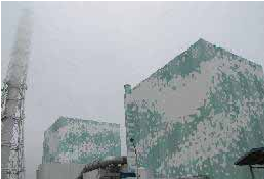
Overview of a reactor building from southwest side Sep 15, 2011