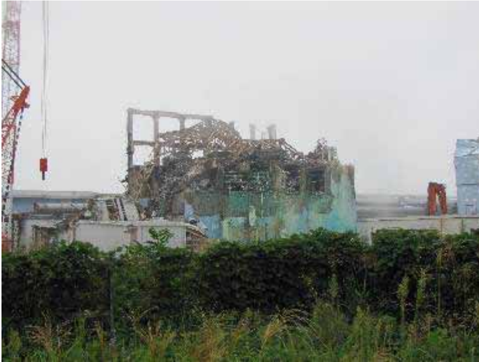
Overview of a reactor building from western hilltop Sep 15, 2011