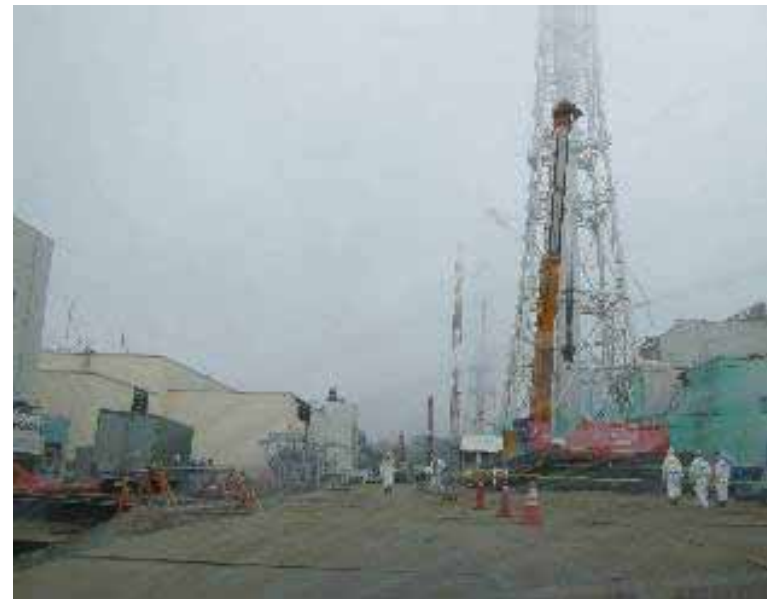
Rubble collection preparation of a reactor building ~ north direction from Unit 4 ~ Sep 15, 2011