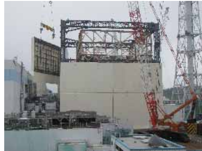
Reactor building cover from northern side Sep 15, 2011