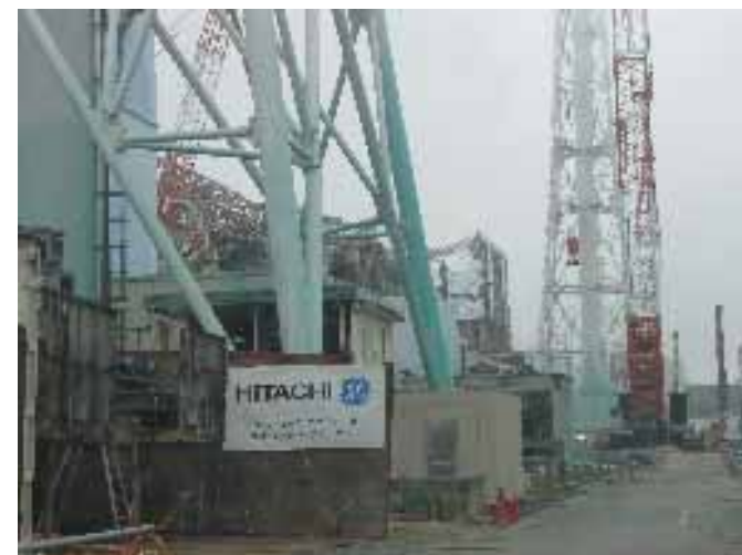
Southern direction (Unit 3 & 4) from Unit 1 Sep 15, 2011