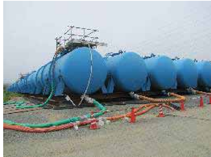
RO concentrated water storage tank (H1 area) Sep 15, 2011