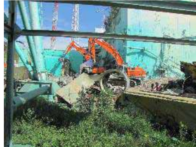
Rubble collection around southwest of a reactor building Sep 16, 2011