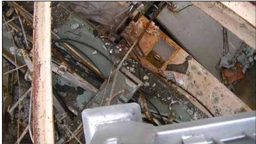
Recording date: August 24, 2011