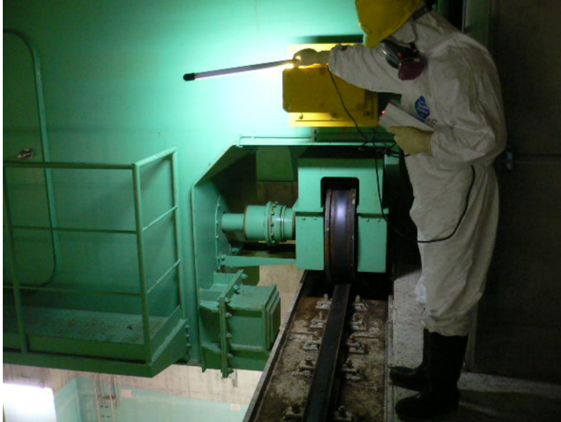
date : October 27, 2011