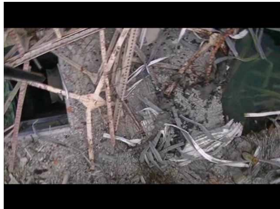
Recording date: November 5, 2011