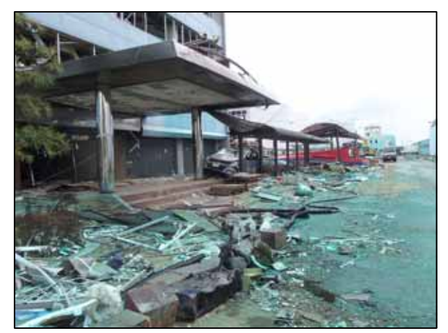
May 27, 2011