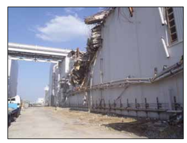
May 14, 2011

Other photos are published on the report "Roadmap towards Restoration from the Accident at Fukushima Daiichi Nuclear Power Station (November 17, 2011)"