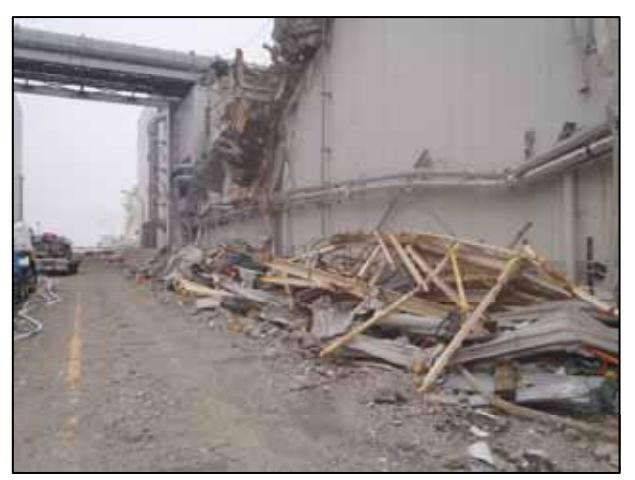
May 3, 2011