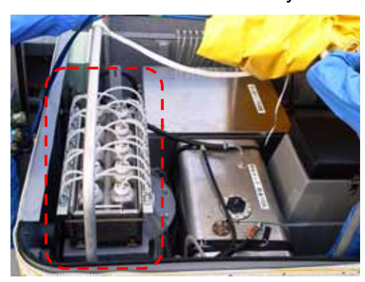
<3 Operation hut>

November 21, 2011 Tokyo Electric Power Company