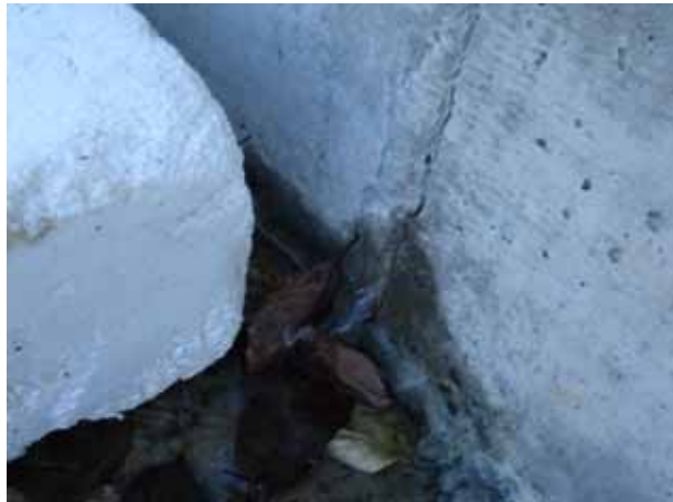
Status of leakage (part 1)