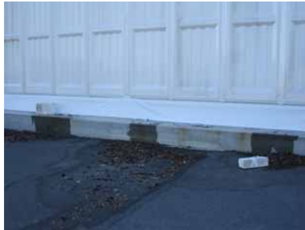
Status of leakage (part 2)