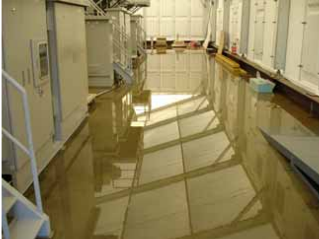
Evaporative condensation apparatus (indoor)

December 4, 2011 Tokyo Electric Power Company