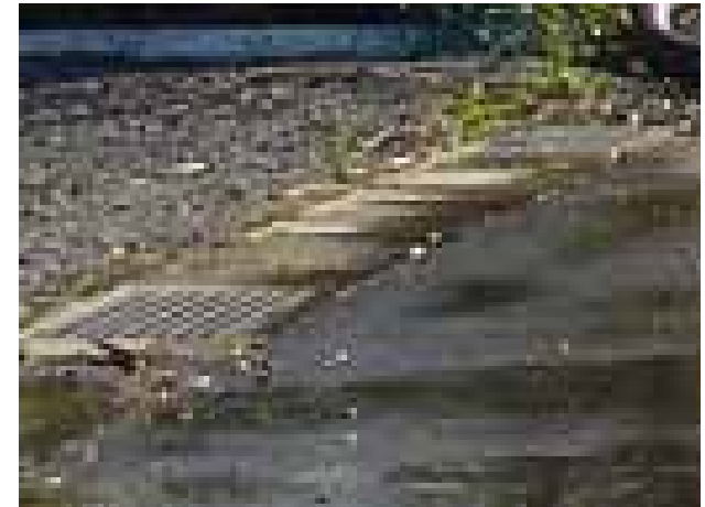
Gutter close to evaporative condensation apparatus Photos taken on December 4, 2011