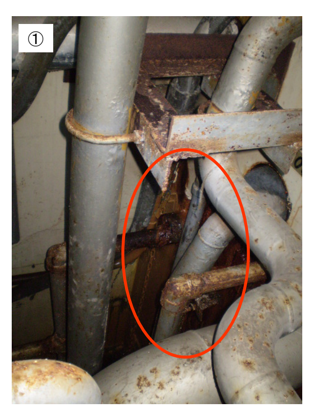
The location where the water inflow was traced