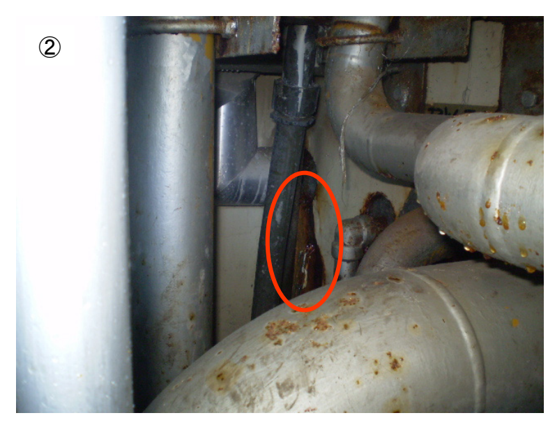
The location where the water inflow was confirmed