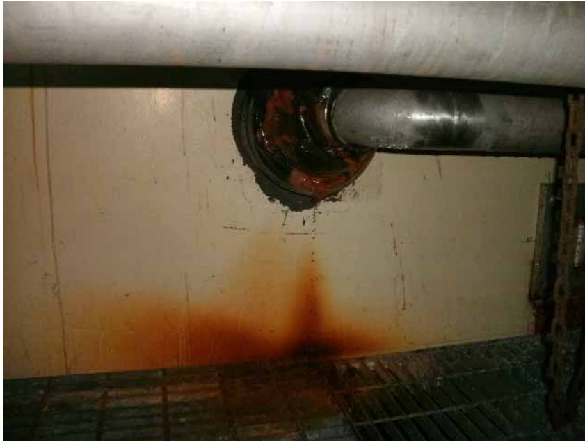
1. Location where water flow was confirmed on Unit 2 Offgas Pipe Duct