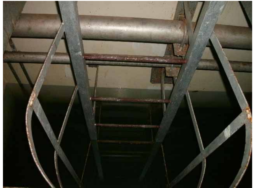
2. North Wall of the Spent Resin Storage Tank Room