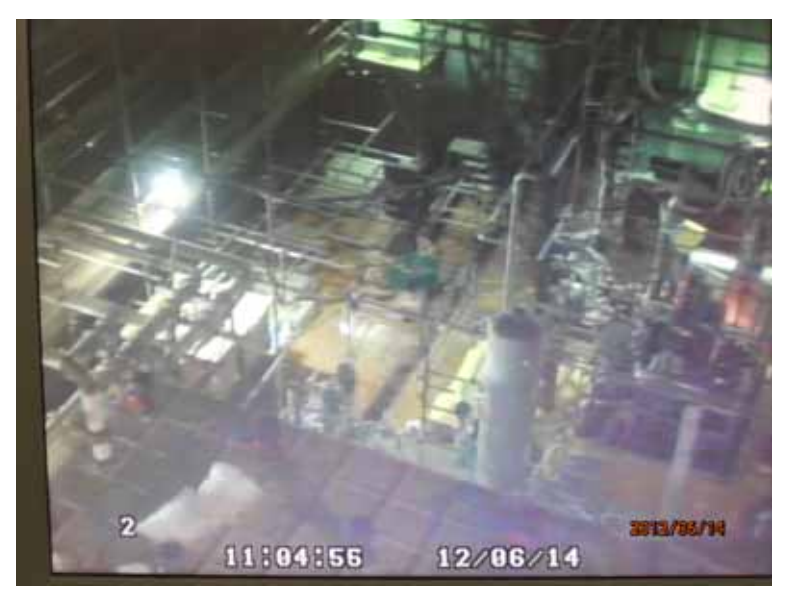
Monitoring camera image