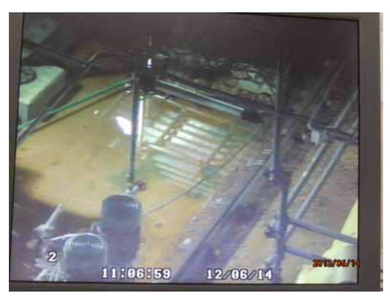
Monitoring camera image (Enlarged)