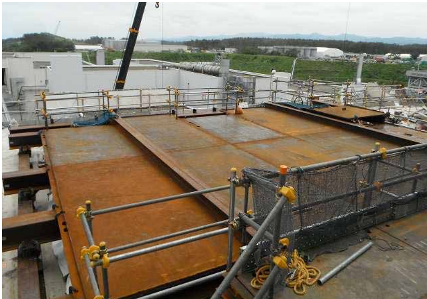
Protection platform installation on the Spent Fuel Pool Photo taken on June 15, 2012