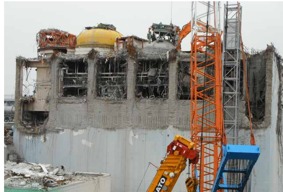
After debris removal (Upper part of the operating floor, west surface) Photo taken on July 9, 2012