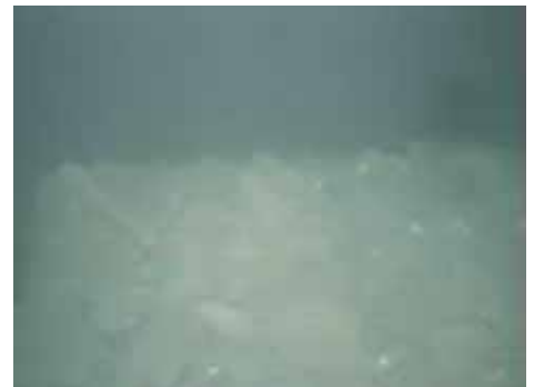
Debris on the fuel storage rack investigated on September 24