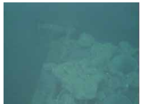
Steel beam investigated on September 25