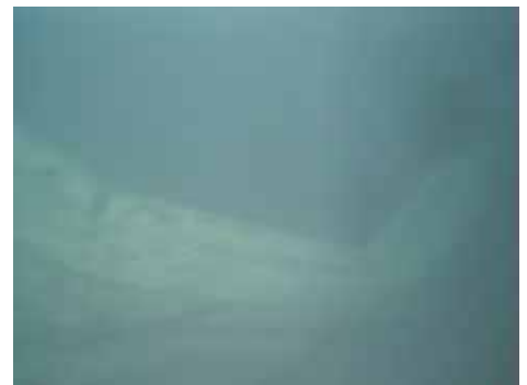
Steel beam investigated on September 24

* Photos and are captured images of the underwater camera video recorded on September 24.