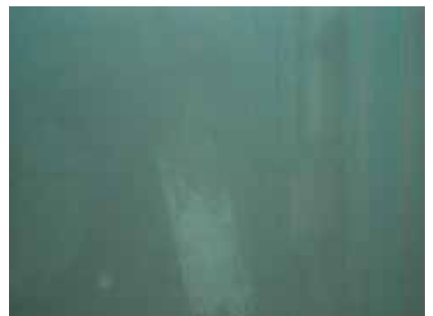
Steel beam investigated on September 25