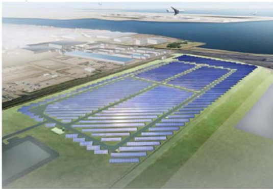
(1) Ukishima Solar Power Plant (provisional name)