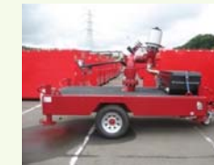
Large-capacity water cannons have been deployed that use moisture to deposit radioactive materials when released following a severe accident

Since September, training has been underway to allow personnel to experience and understand hazards.