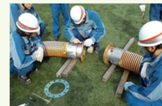
Training in connecting temporary hoses (Fukushima Daiichi)