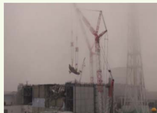
Unit 3: Lifting out large rubble (fuel handling machine)

Seawater pipe trenches have been sealed and groundwater begun to be pumped out of wells (sub-drains) near buildings along with the advancement of other measures to address contaminated water, which are significantly reducing any leakage of highly contaminated water and the risk of such developments.