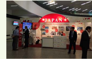
Panel presentation at IAEA General Conference