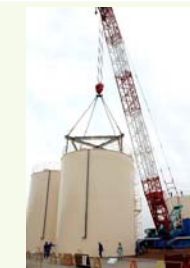
Unloading tanks on to Fukushima Daini NPS quay