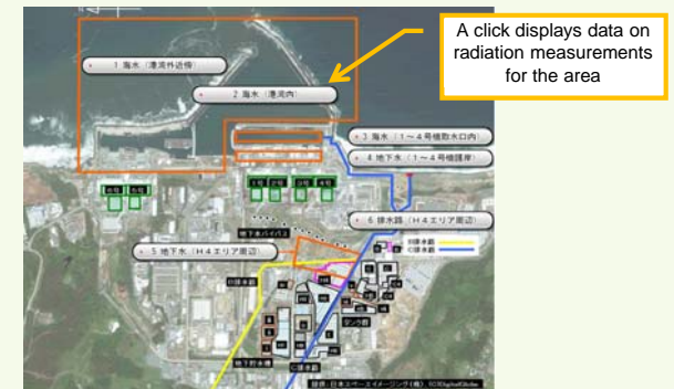
Data disclosed on TEPCO's website (results of analysis of radioactive materials in the surrounding area)