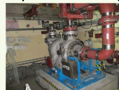
Additional alternate high-pressure water injection facilities have been installed to multiplex reactor cooling water injection functions

In addition to construction of a 15m high seawall, the lessons learned from the Fukushima nuclear accident have been taken into account and the construction of safety measures steadily advanced in preparation for station blackout, and an intensive examination began in August to review compliance with new regulatory requirements.