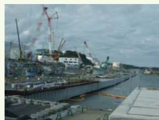
Restarting sheet pile installation for impermeable wall on ocean side

The environment is being improved. Since the Fukushima nuclear accident, more than 15,000 people have visited the site to see the progress of decommissioning by, for example, participating in tours of facilities used to treat and store contaminated water.