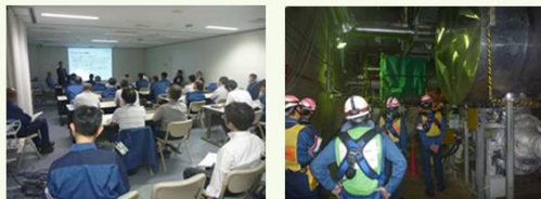
Management observation training for managers (Kashiwazaki-Kariwa NPS)