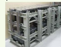
Additional 125V DC storage batteries have been installed to ensure DC power source capacity that is three times greater (over 24 hours) than before