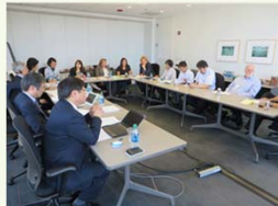
Leadership development plan briefing at Exelon Corporation