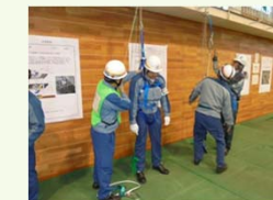
Equipped with full-harness safety belts, personnel practice hanging