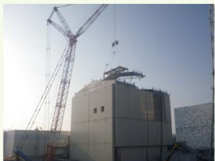
Unit 1: Dismantling of building cover (roof removal)

Work directed at fuel removal is steadily moving forward with the reactor building cover beginning to be dismantled at Unit 1 and the removal of large rubble completed from inside the spent fuel pool at Unit 3.