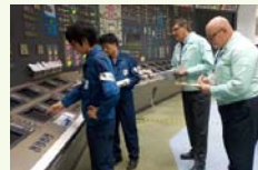
Observation of operations by expert team (Kashiwazaki-Kariwa NPS)