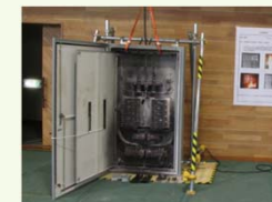
Actual switchboard displayed which caught fire and spread due to his short circuit during work (to learn about the dangers of short circuits)