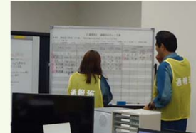
Whiteboard being used during emergency training (Fukushima Daini NPS)