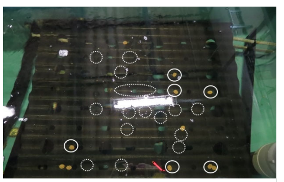
Leftover condition in regular seawater tank (Morning of February 14, 2023)