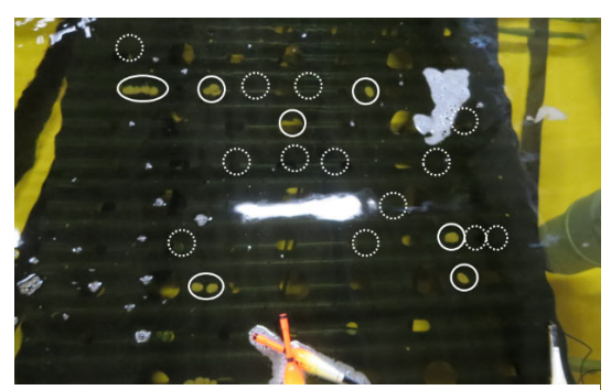
Leftover condition in ALPS treated water added tank (Morning of February 14, 2023)