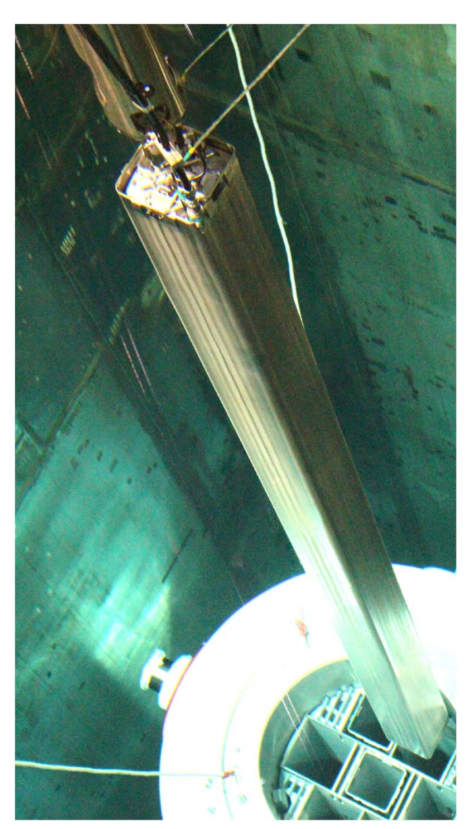
Hoisting from a transport container