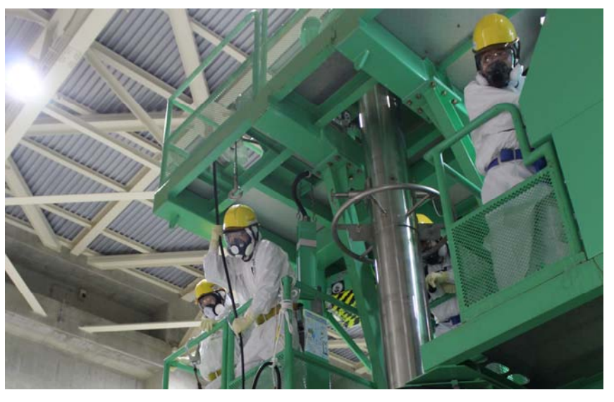
Working in the common pool