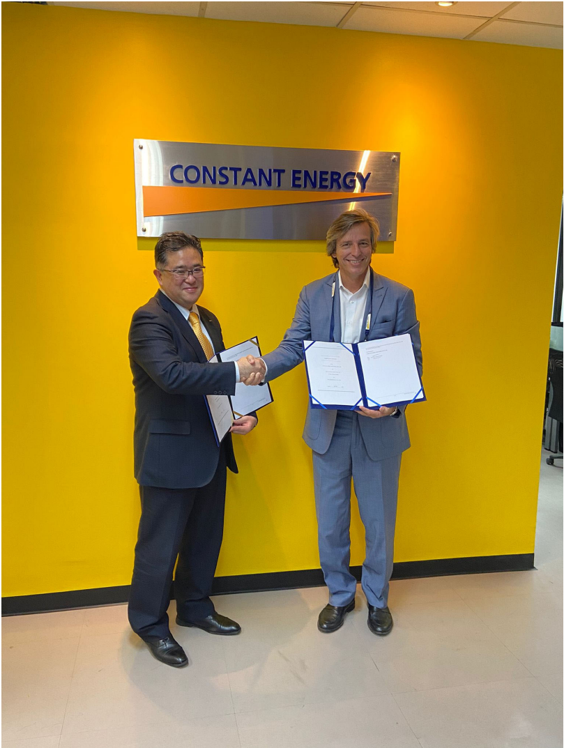
Signing of the Shareholders Agreement