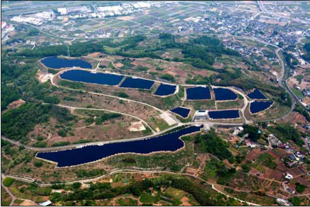
(Reference) Appearance of Komekurayama Solar Power Station