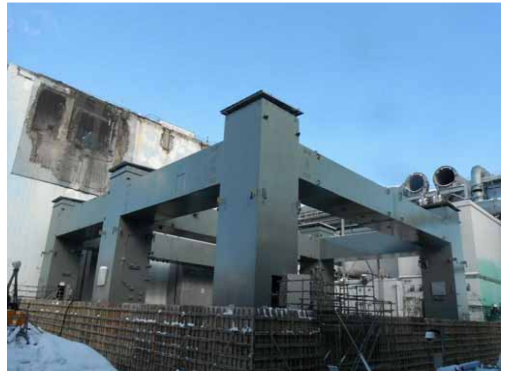
The first layer of steel framing completed

The first layer of steel framing has been completed