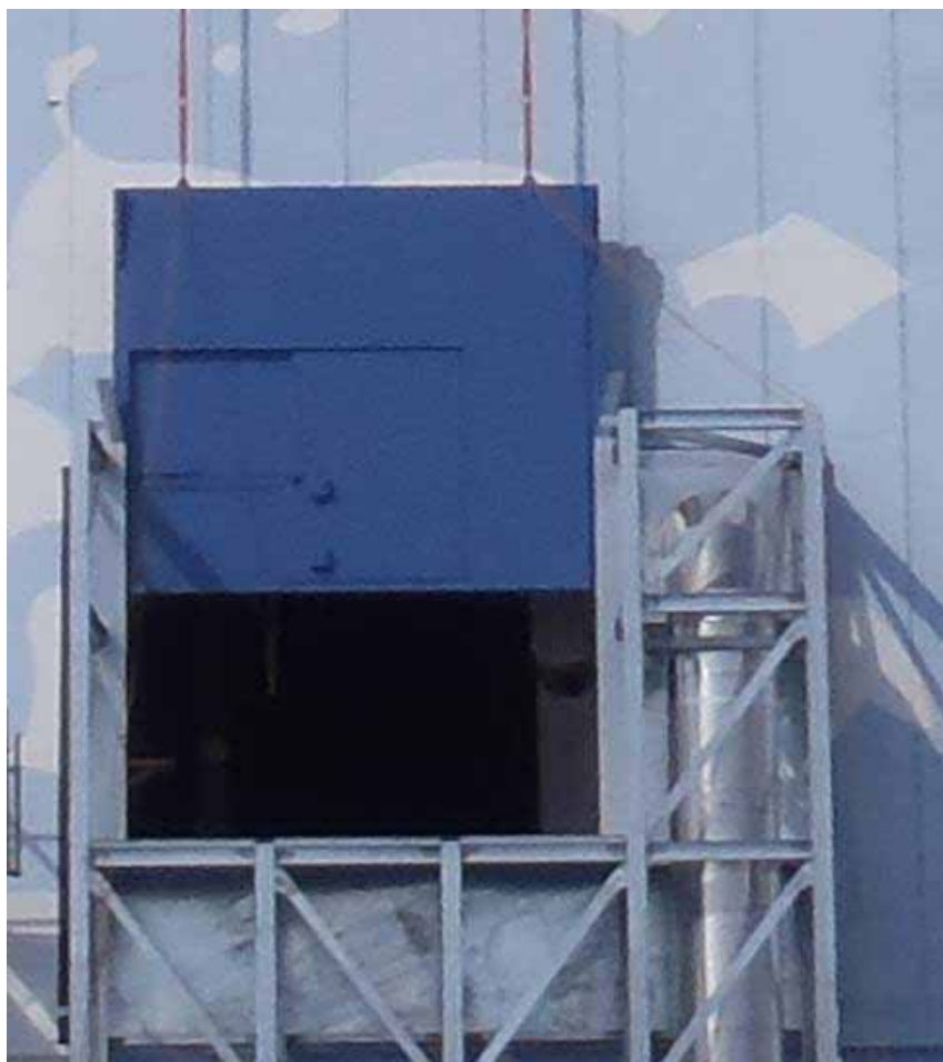
Closure panel being installed