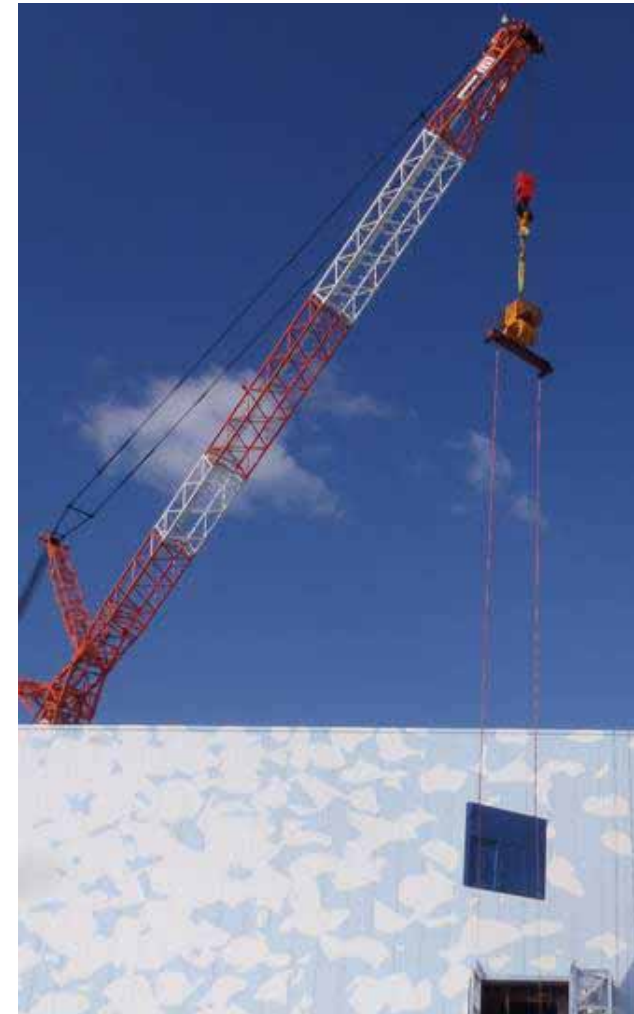
Closure panel* being lifted up