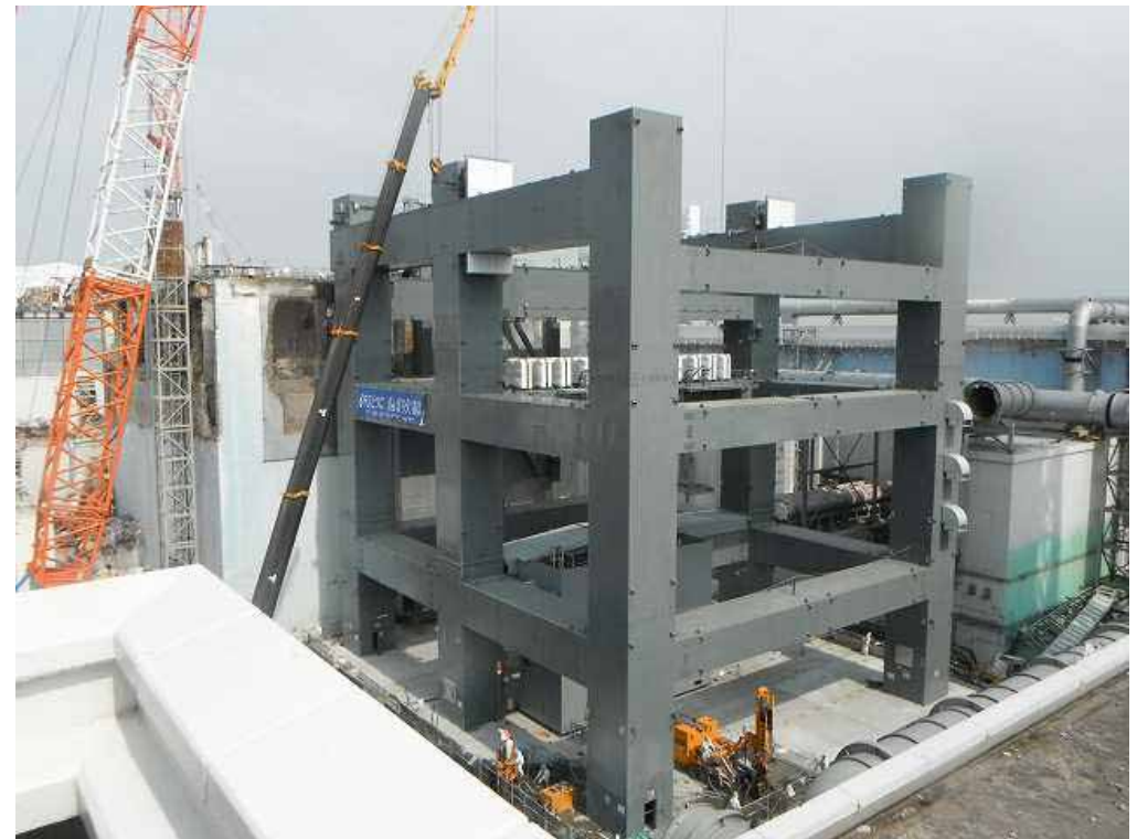
The third layer of steel frame completed

Steel frame up to the third layer has been completed today