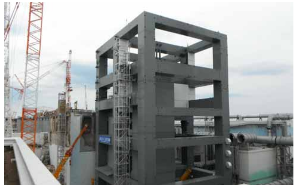
Progress status of the steel frame construction (as of April 10, 2013)