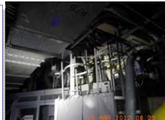
Conditions in upper space in R/B's 1st floor (Unit 2, as an example)

The high-access survey robot jointly developed by the National Institute of Advanced Industrial Science and Technology and Honda Motor Co. Ltd. will be applied in a joint research conducted by these two companies and TEPCO.