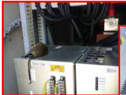
Contact condition of a small animal and the device