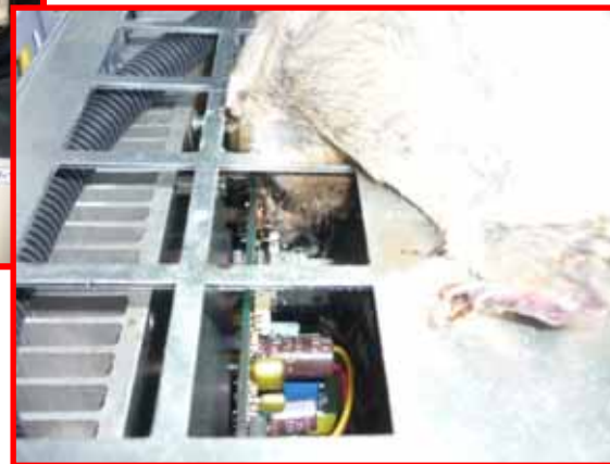
Contact condition of a small animal and the device (enlarged view)