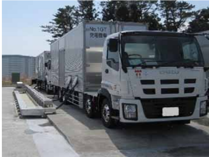
Air-cooled gas turbine generator vehicle (No.1) (Near side: generator vehicle, far side: control vehicle)

Tokyo Electric Power Company Fukushima Daini Nuclear Power Station