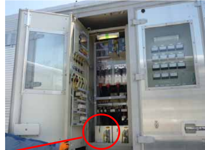
A device in the charger panel (control vehicle)