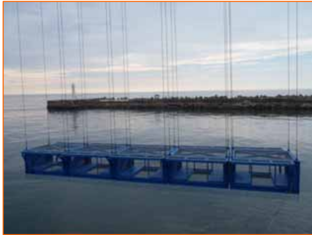
On July 11, installation of block fence at the port entrance was completed. (Photo: Installation work of the block fence)