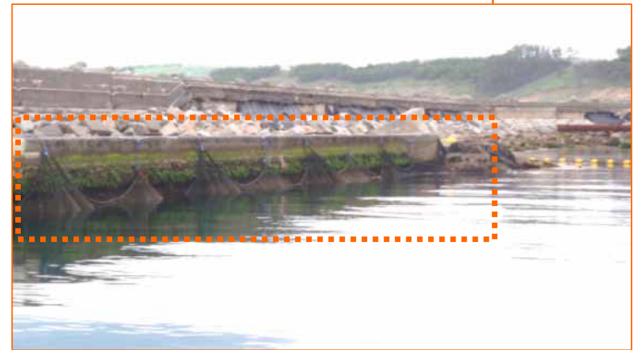
On June 26, installation of partition net around the south breakwater was completed.