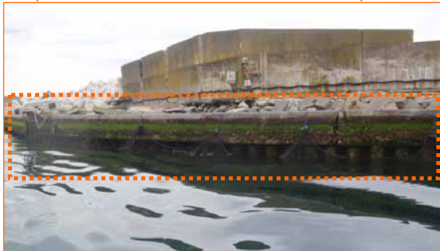
On June 26, installation of partition net around the north breakwater was completed.