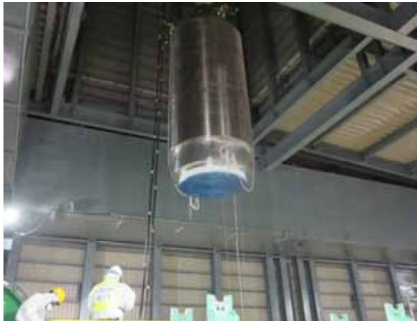
Lifting up to the operating floor

On November 13, the handling of an on-premise transportation container to be actually used in the fuel removal operation was confirmed using actual machines.