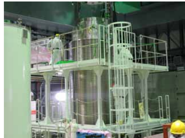
Transfer to the container-preparation pit ③