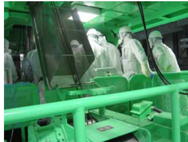
Photos provided by Tokyo Electric Power Company and taken on November 15, 2013