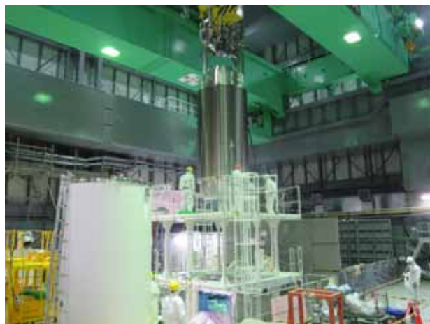
Transfer to the container-preparation pit ②