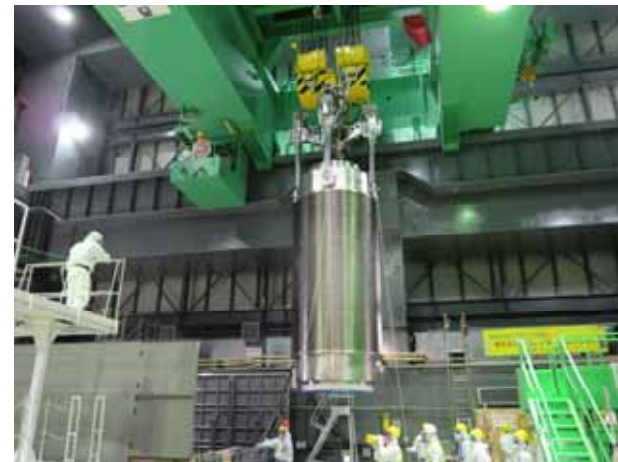
Transfer to the container-preparation pit ①