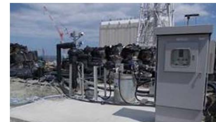
Sealed-up structure is applied to pump-up wells