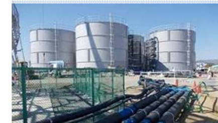
Special tanks and pipes are installed.