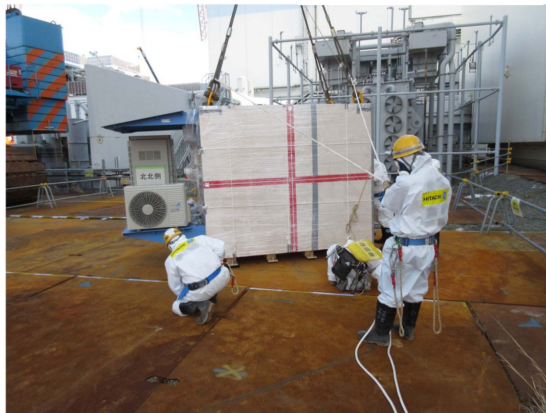
Installation scene (II)

dated Feb. 9, 2015