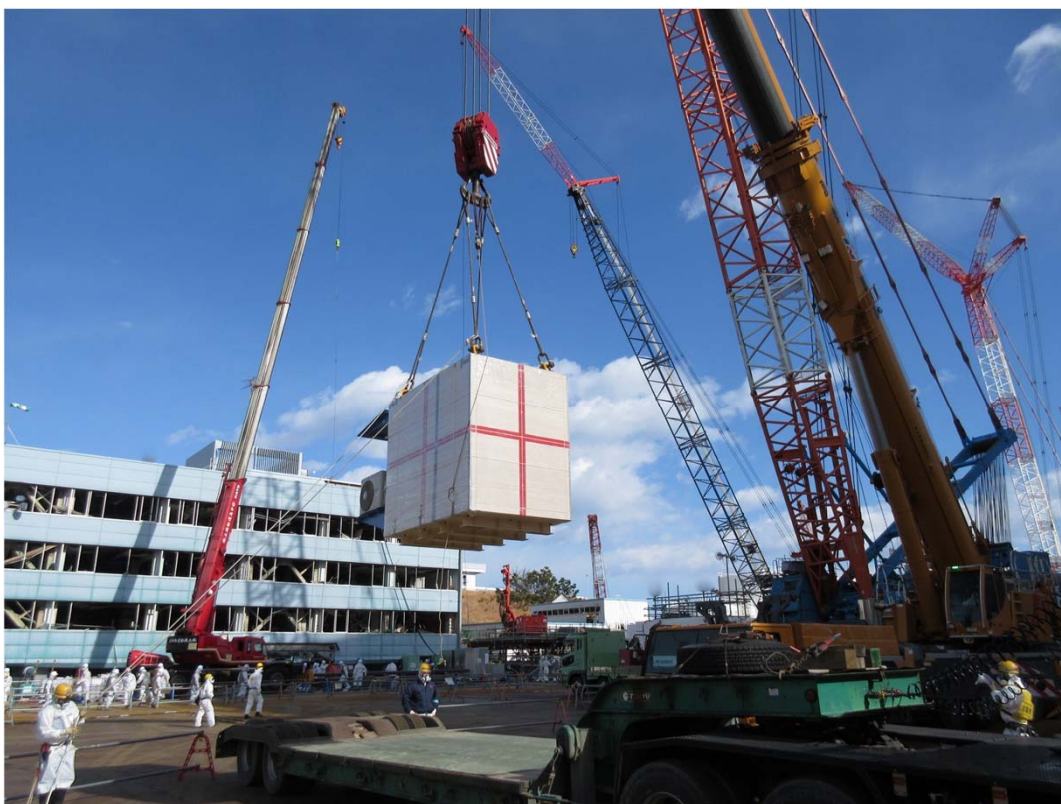
Installation scene (I)