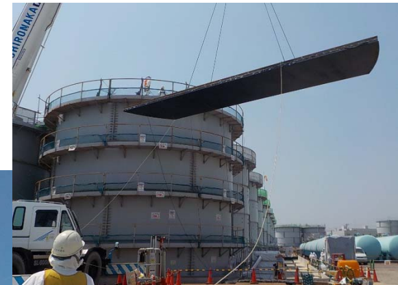
Removal of top board↑