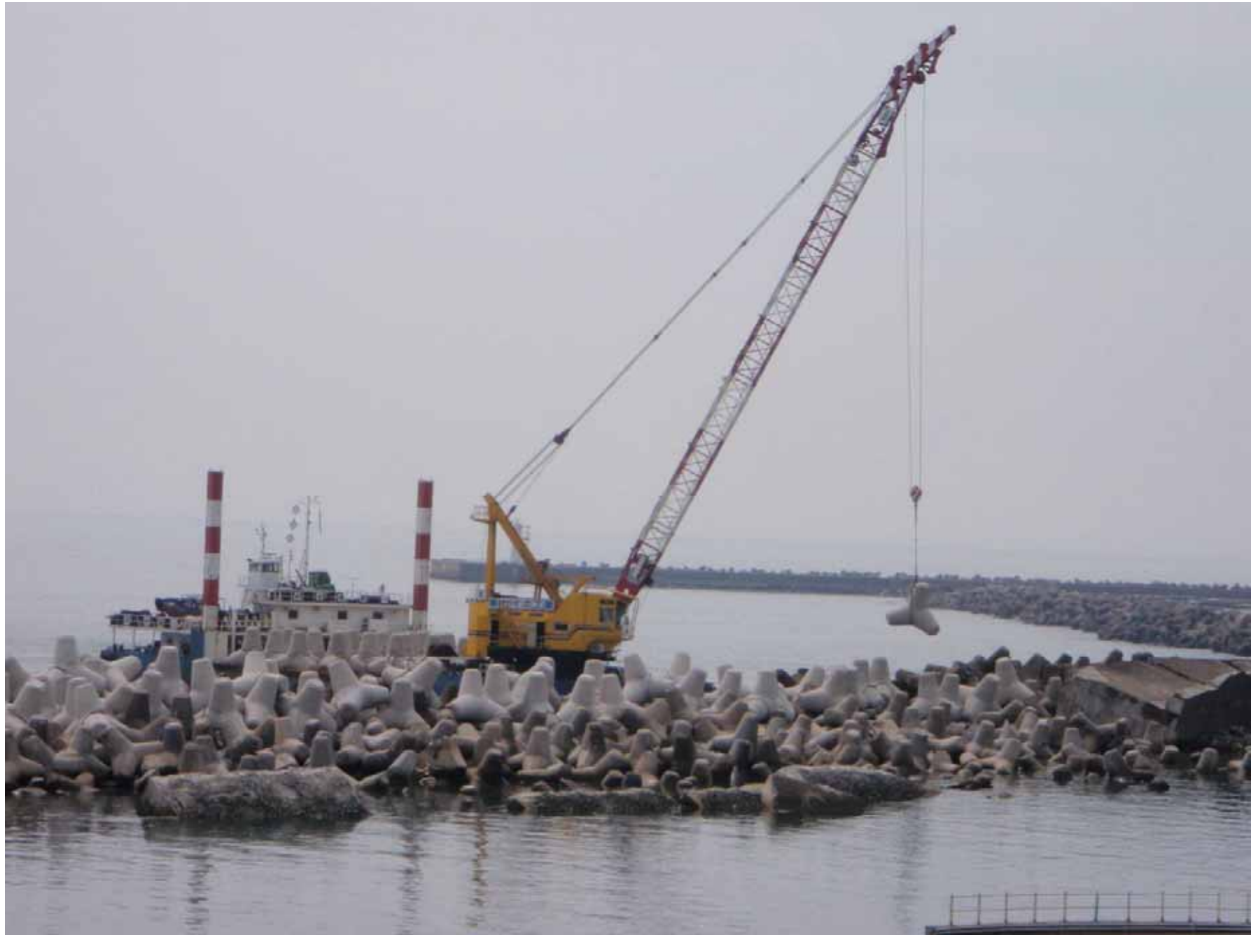
Breakwaters for Unit 5 and 6 (Under construction) June 8, 2011