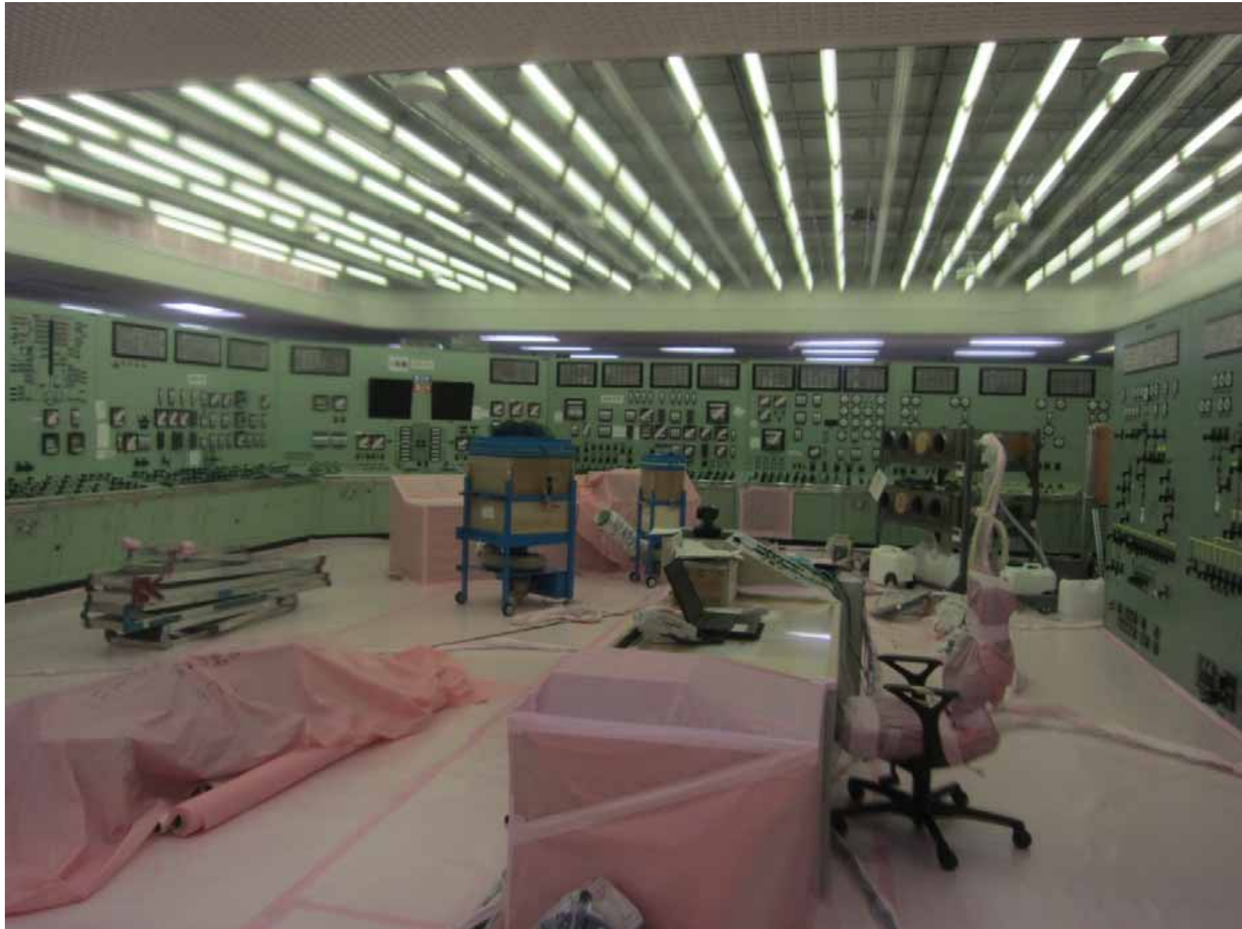
Main control room of Unit 1 and 2 September 22, 2011