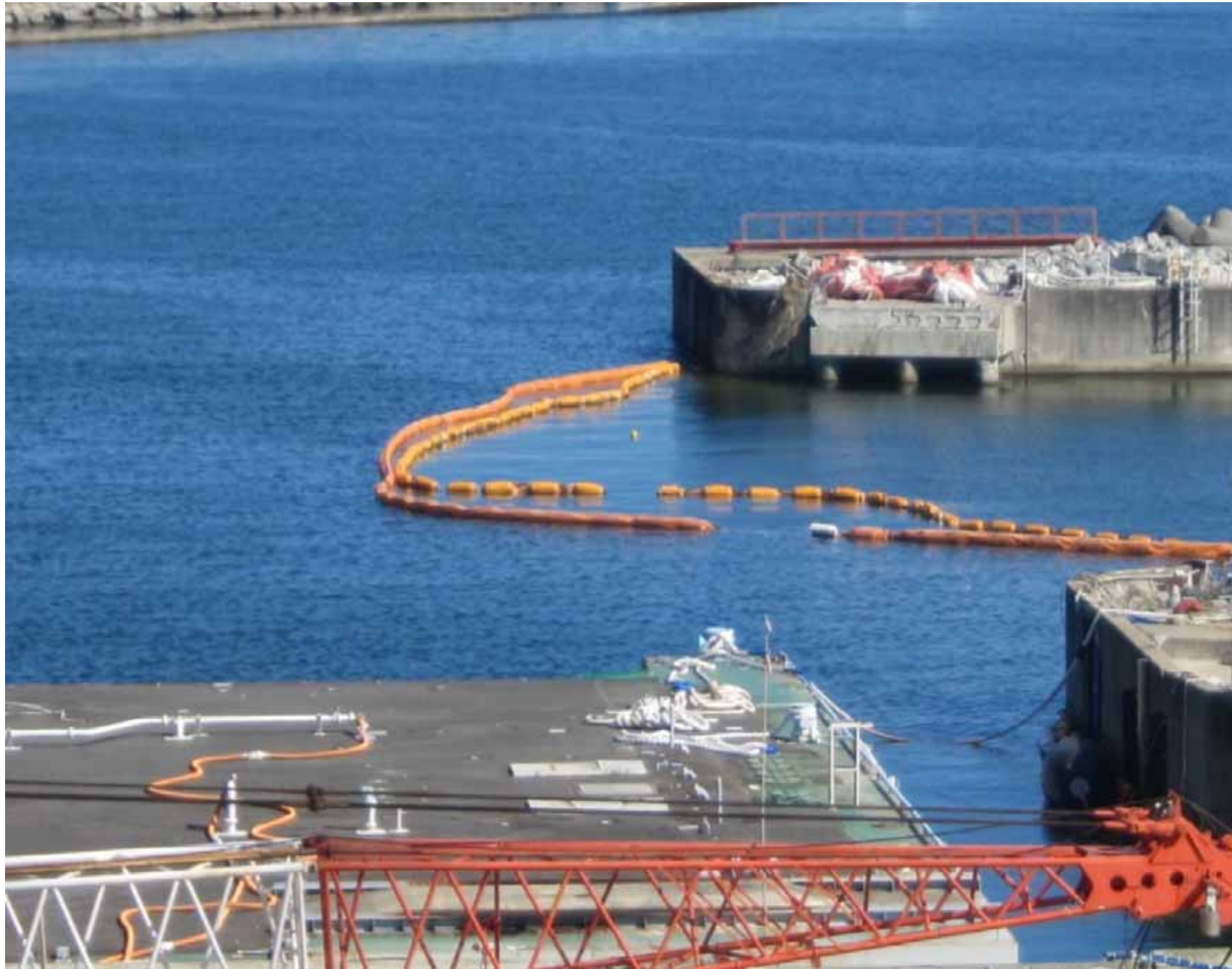
Silt protector -Around discharge canals of Unit 1-4- September 29, 2011