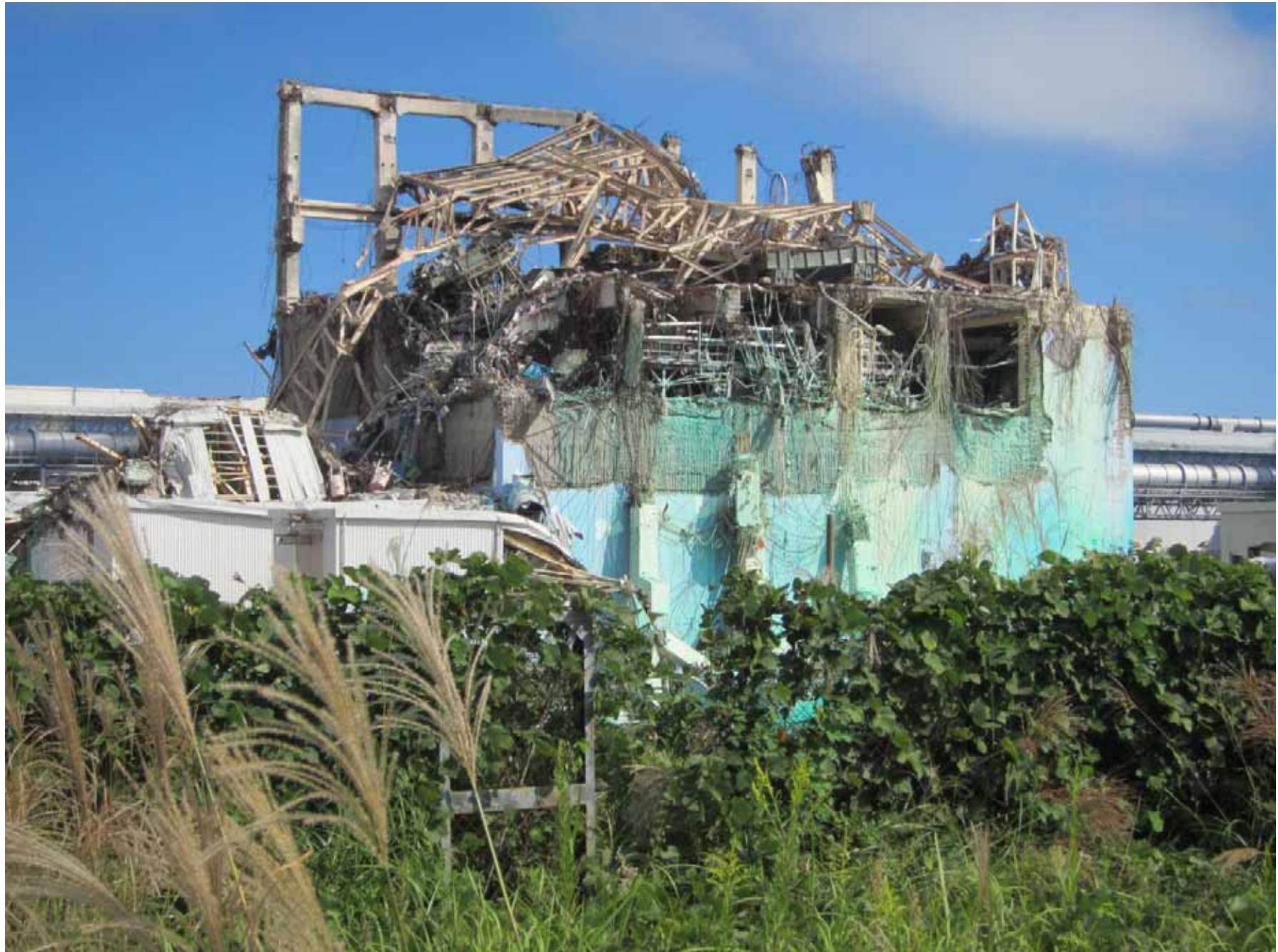
Overview of reactor building of Unit 3 -From western hilltop between Unit 2 and 3- September 29, 2011