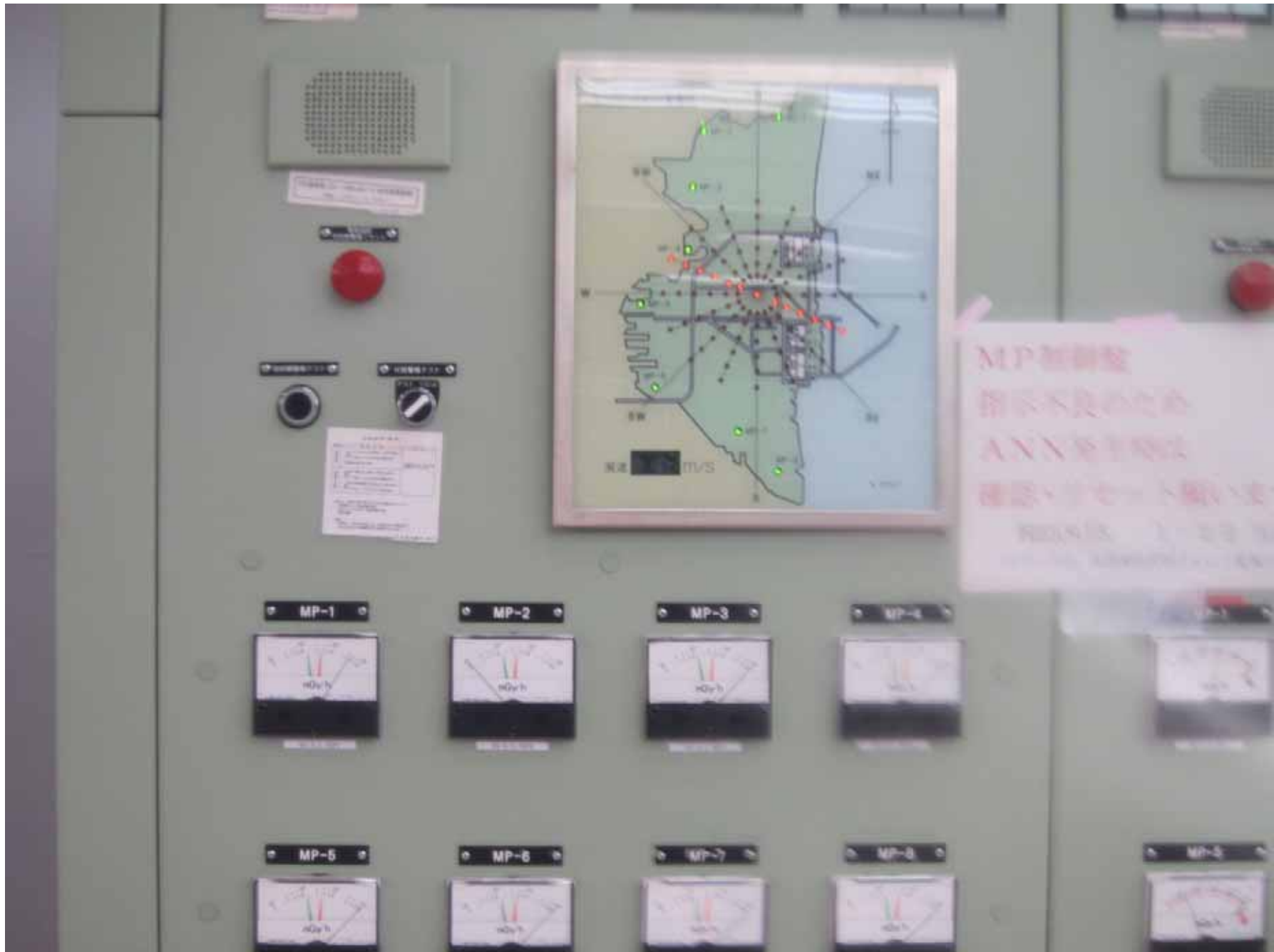
Outside Monitoring Post Control Panel (Monitoring Post) -Main control room of Unit 1 and 2- September 22, 2011