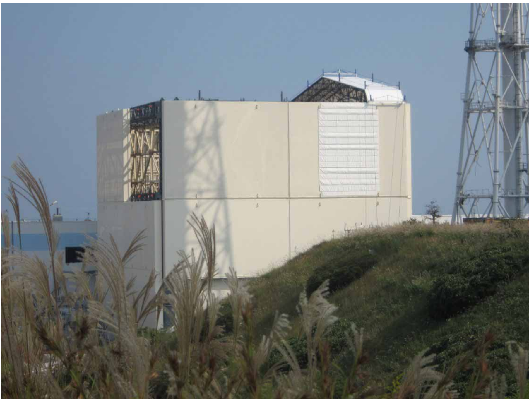
Overview of reactor building of Unit 1 –From south direction of Main Anti-Earthquake Building - October 8, 2011