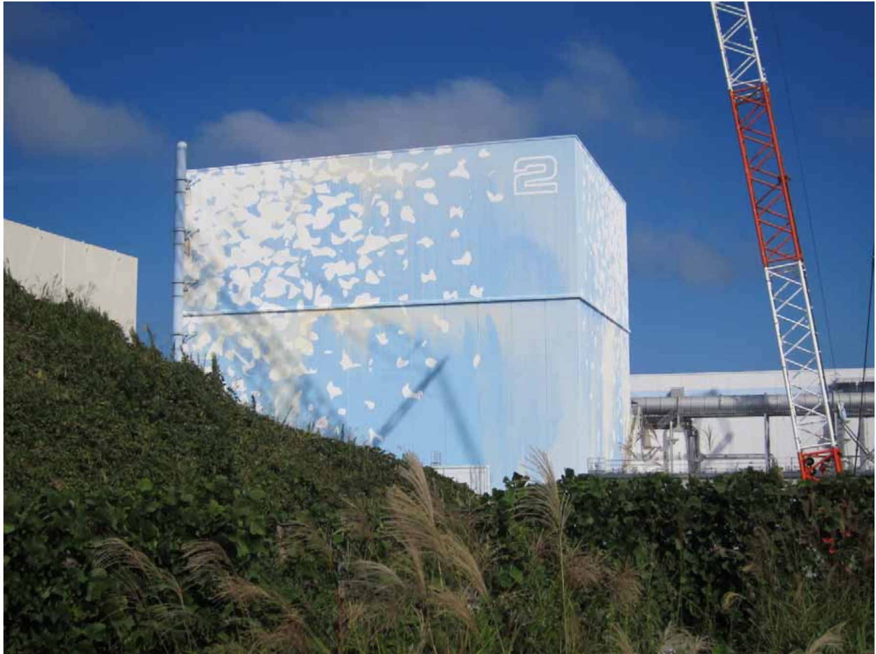
Overview of reactor building of Unit 2 -From western hilltop between Unit 2 and 3- September 29, 2011