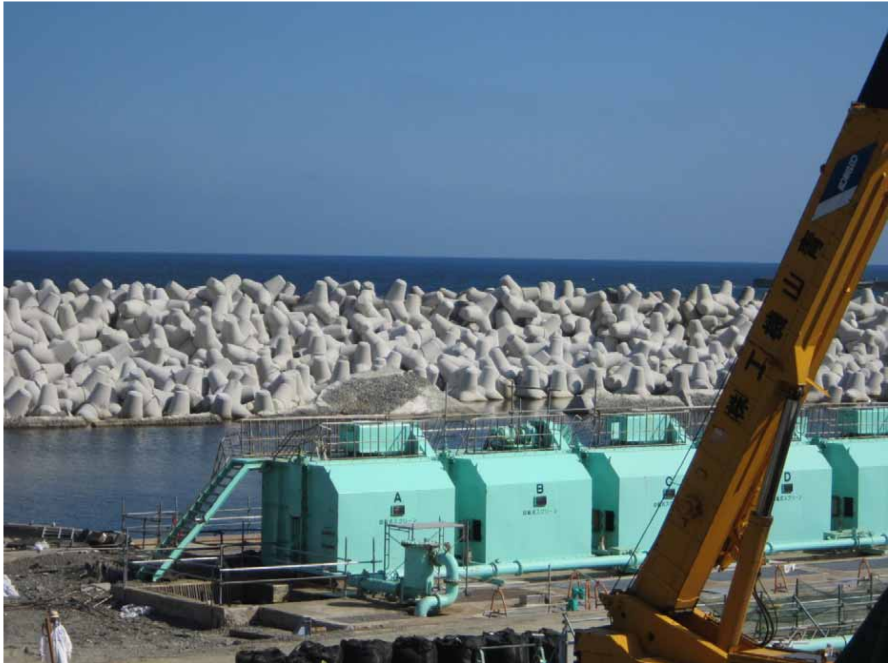
Breakwaters for Unit 5 and 6 September 29, 2011