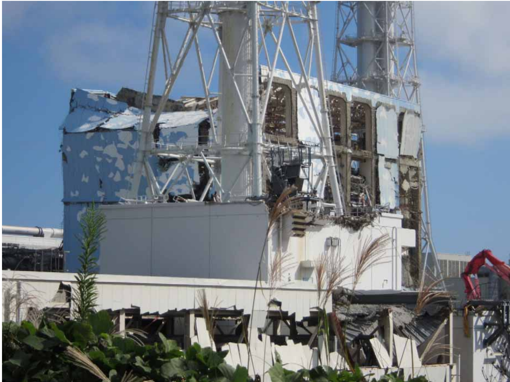
Overview of a reactor building of Unit 4 -From western hilltop between Unit 2 and 3- September 29, 2011