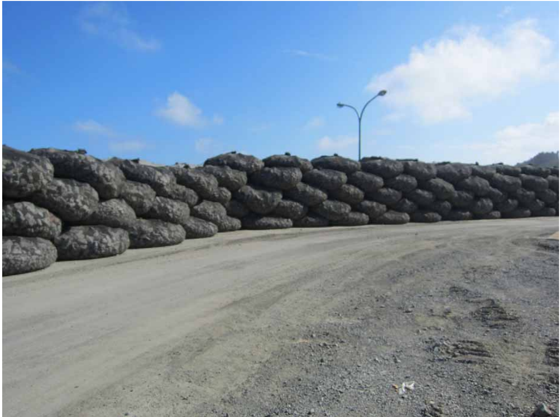
Breakwaters –From the shore- September 29, 2011