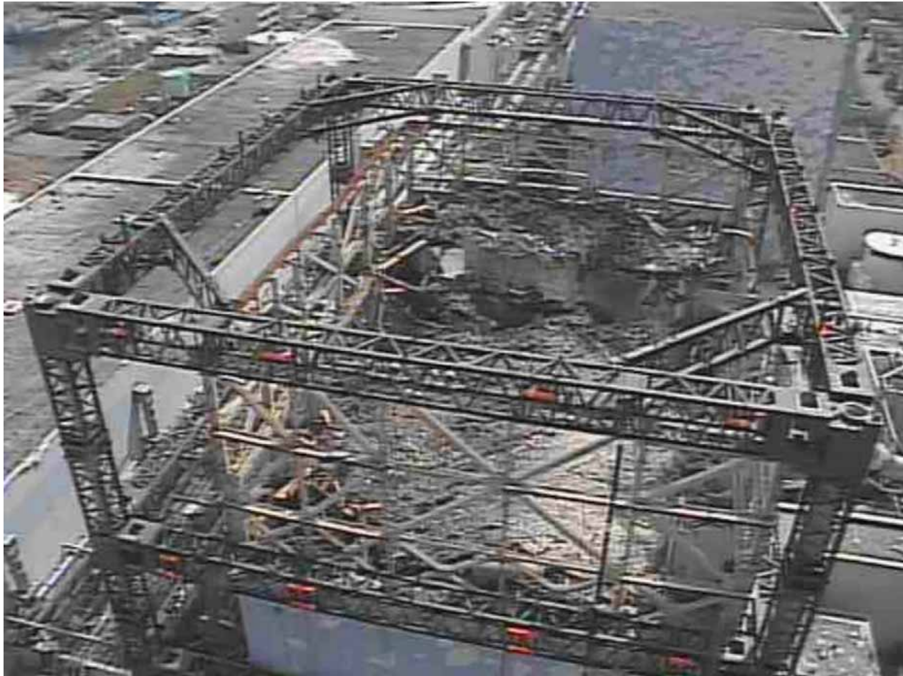
Overview of reactor building of Unit 1 –From a crane above Unit 1- September 9, 2011