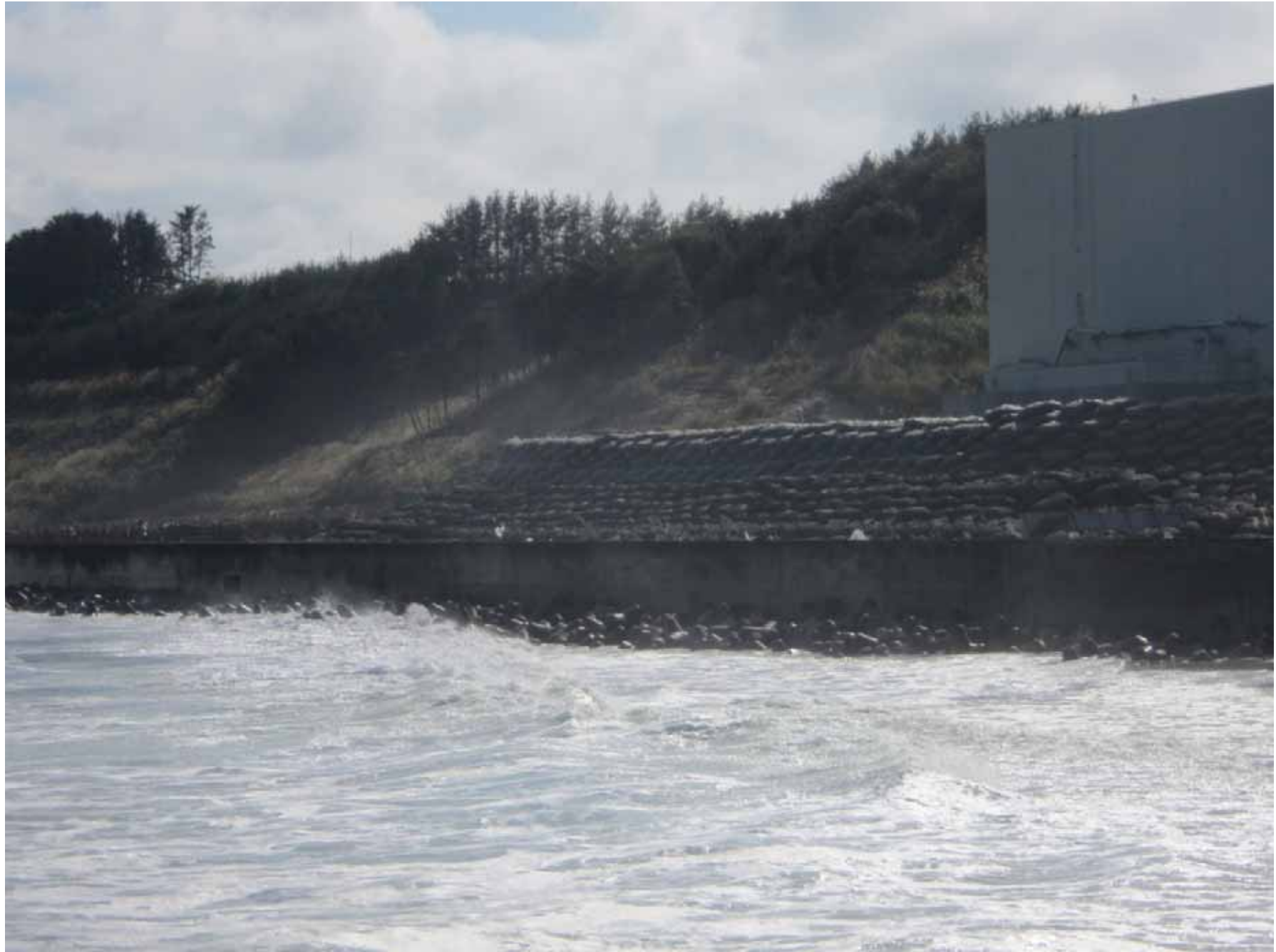
Breakwaters -From the sea- September 29, 2011