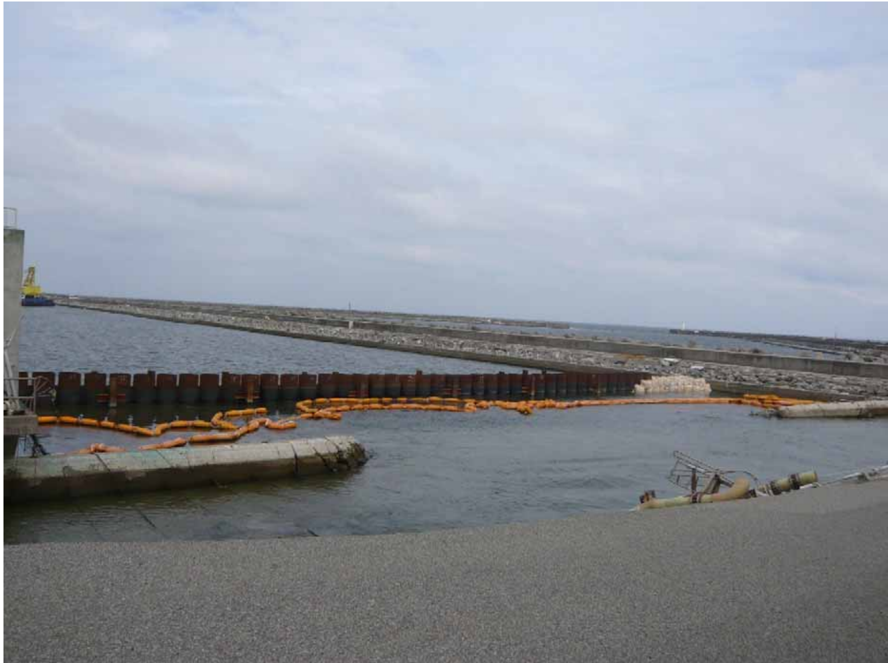
Steel pipe sheet-pile -Around discharge canals of Unit 1-4- September 28, 2011