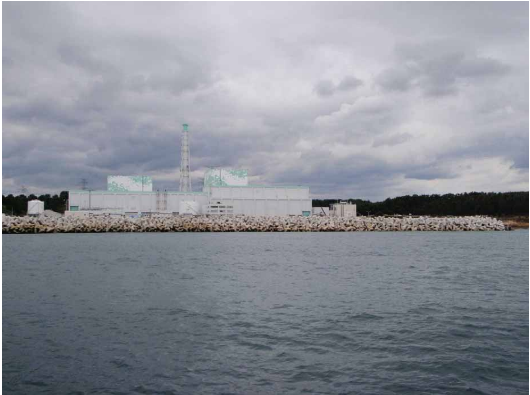
Breakwaters for Unit 5 and 6 (Complete) October 5, 2011