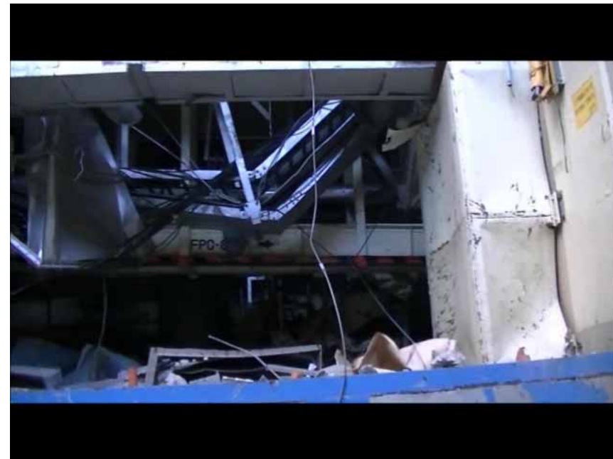
Video : Tokyo Electric Power Company October 12, 2011

Video was taken on October 12, 2011 when the dust sampling was conducted at equipment hatch in the reactor building. Location of camera may not be exact.